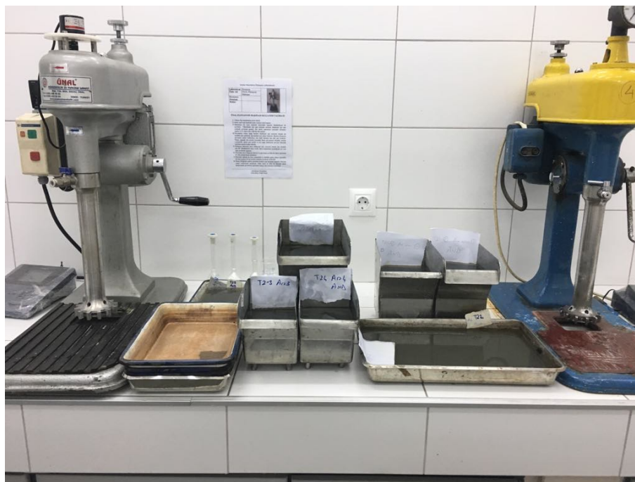
Fig. 4. The flotation devices used in the experiments