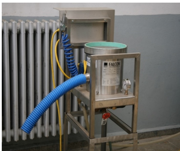
Fig. 3. A Laboratory-Type L40 Model Falcon Separator

Preliminary enrichment tests of samples of Sulphur type ore and oxide type gold ore from Konya Inlice region were carried out using a laboratory type L40 model Falcon separator. The Falcon L40 separator is shown in Figure 3, and the technical specifications are given in Table 3.