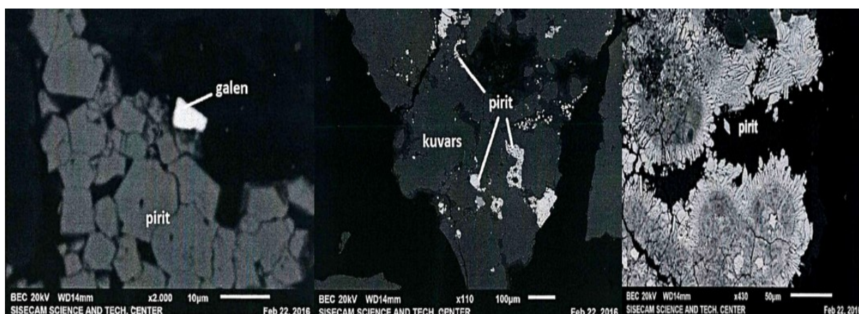
Fig. 1. Microscopic images of Sulphur type ore sample