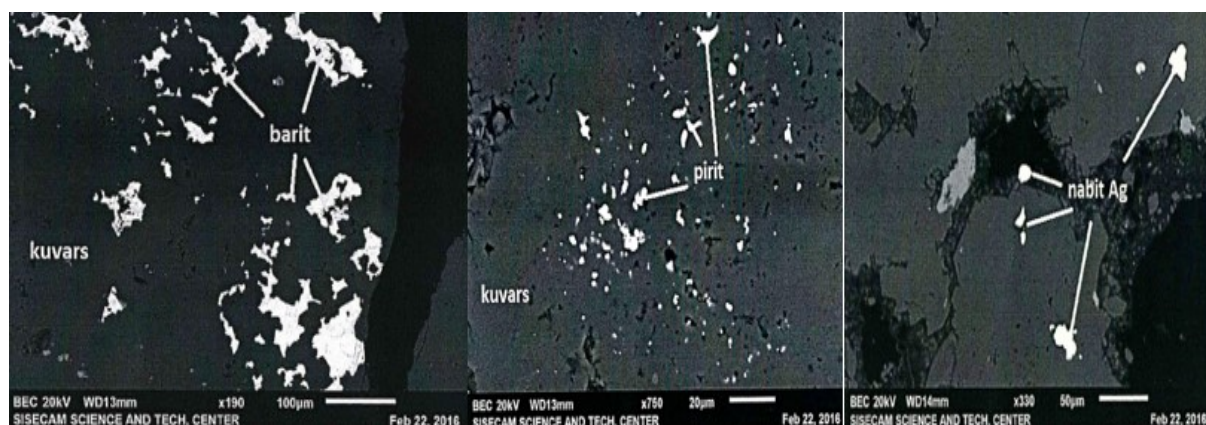
Fig. 2. Microscopic images of Oxide type ore sample