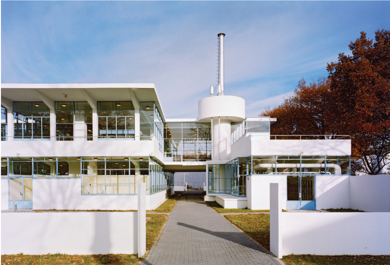
Fig. 1. “Zonnestraal” sanatorium, main building (1928) after restoration in 2003. View through one of the driveways that were restored

Il. 1. Sanatorium „Zonnestraal”, budynek główny (1928) po renowacji w 2003 r. Widok przez jeden z odrestaurowanych podjazdów