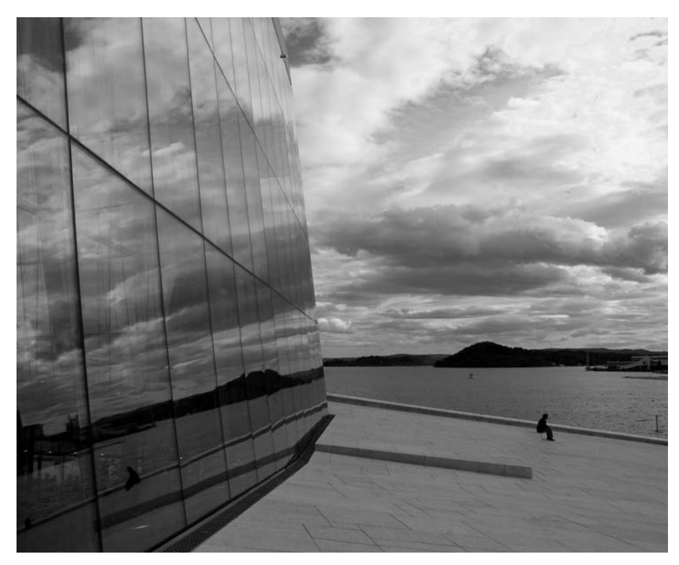
Fig. 12. Den Norske Opera & Ballet in Bjørvika in Oslo (arch. Snøhetta, realization in 2008) – Opera glass façade reflects the surrounding area of the object II. 12. Den Norske Opera & Ballet w Bjørvika w Oslo (arch. Snøhetta, realizacja 2008 r.) –

szklana fasada opery odbijająca otoczenie obiektu