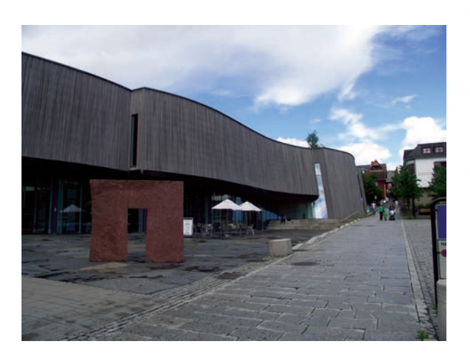
Fig. 3. Lillehammer Olympic Art Museum (arch. Snøhetta, realization in 1994) – view

Sentralstasjon). Karl Johans Gate was designed in 1826 by the royal architect H.D.F. Linstow soon after the constitution was adopted by Norway in 1814. Originally, it connected the Royal Palace with a historic quarter 'Kvadraturen'. Thirty years later, the street was broadened and modernized. In particular, the western part of the street at Studenterlunden Park was arranged so as to make it possible to organize annual ceremonies on the occasion of the National Holiday on May 17, whose main attraction are children parades. The street is modernized all the time, which is manifested in the attractively designed pavement as well as in small architecture. One of the most interesting objects is the 'Kiosk' – a building-sculpture (arch. Snøhetta, realization in 2005) with a minimalist form which is contrasted with the 19th-century buildings (Fig. 2). A raw wooden construction - surrounded by summer gardens with the unique texture and colour constitutes a part of the,