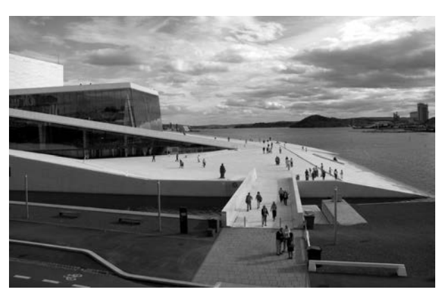
Fig. 7. Den Norske Opera & Ballet in Bjørvika in Oslo (arch. Snøhetta, realization in 2008) – view of Bjørvika peninsula

In order to characterize the futuristic building of the Opera House in Oslo (arch. Snøhetta, realisation in 2008), we can risk a statement that this is the object which misses to some extent the features of a traditionally understood concept of building. A more appropriate term would be 'artificially constructed sculptural landscape' which became an integral part of the natural promontory and Bjørvika Bay (Fig. 7). A large group of architects and artists from different nations worked on the final image of the object. This building conveys numerous meanings: it emphasizes the place of the city origin, moves the sensual nature of man by means of its form and evokes extreme associations: starting from marble temples of sunny Italy and ending with the beauty of the rugged Norwegian landscape. As the object of a cultureproducing function, it constitutes an integral part of the city area as its continuation and unique complement. It forms an extension and is one of the two – apart from the Royal Palace – culmination points of the main transportation artery of the capital city of Norway. The city pedestrian precinct Karl Johans Gate undergoes a smooth transition into a glass connector from where people can admire 'topography of the object'. The last realization phase of the designed object comprises a sculpture on the water situated in front of the Opera House in Bjørvika Bay (designed by: Hun ligger/she lies, author: