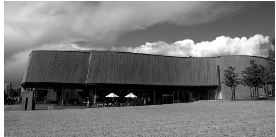
Fig. 5. Lillehammer Olympic Art Museum (arch. Snøhetta, realization in 1994) – view from the side of the square

II. 5. Lillehammer Olympic Art Museum (arch. Snøhetta, realizacja 1994 r.) – widok od strony placu