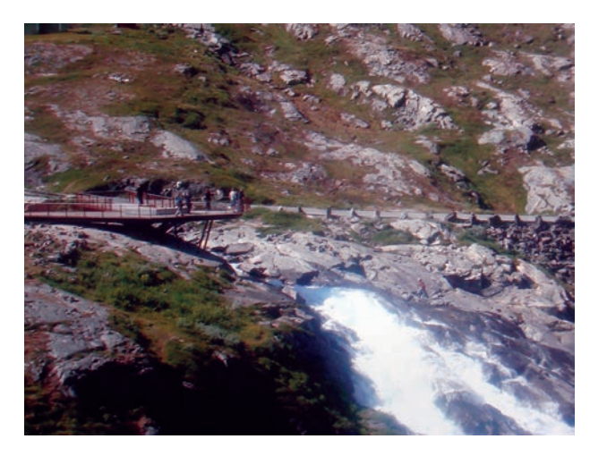
Fig. 1. Trollstigplatået Geiranger – Trollstigen (arch. Reiulf Ramstad Arkitekter AS, under realization 2004–2010) – light steel construction finished with wood enabling observation of Troll Road

Some of the objects constitute a kind of an artificially formed observation terrace which is situated above natural forms: a waterfall, forest or open beach and usually connected with a car park. Those terraces, which are situated over waterfalls as beauty spots, represent a wide variety of solutions: Svandalsfossen (architect Haga Grov/ Helge Schelderup, realization in 2006) as a combination of snow-white concrete and full balustrades made of dark wood; Videsaeterfossen (architect Jansen & Skodvin, realization in 1997) as a form of strongly waved edges with natural stone floor and contrasting balustrades: wooden – full and steel – openwork structure; Trollstigplatået Geiranger – Trollstigen (architect