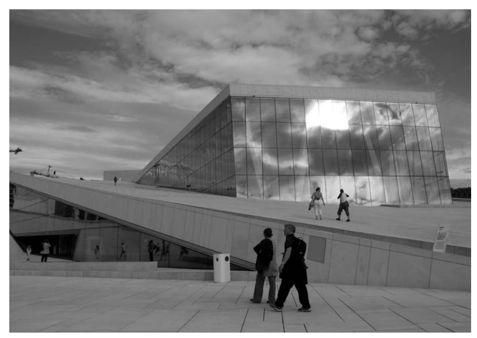
Fig. 8. Den Norske Opera & Ballet in Bjørvika in Oslo (arch. Snøhetta, realization in 2008) – front elevation