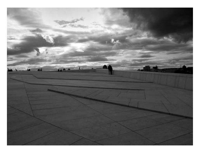
Fig. 9. Den Norske Opera & Ballet in Bjørvika in Oslo (arch. Snøhetta, realization in 2008) – the roof of the Opera House covered with marble slabs

The way in which the form of the Opera House is shaped emphasizes the fact that the place is historically conditioned and it also emphasizes the function of the building – a potential recipient is thus enabled to feel the object with all the senses. The choice of location of the new Opera edifice is not accidental. The building was erected on the peninsula which was the centre of the village in the past – a teeming mediaeval market place which gave rise to the town. The first Oslo – Valley of Gods – was situated to the east of the present city between three rivers the Bjørvik, Alna and Hovin; during the years the rivers were developed and nowadays they flow underground.