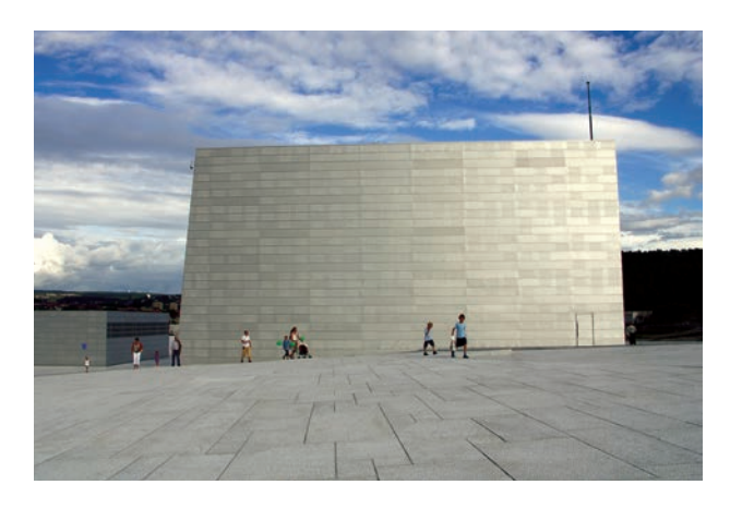
Fig. 11. Den Norske Opera & Ballet in Bjørvika in Oslo (arch. Snøhetta, realization in 2008). The highest point of the building where in the monumental and snow-white scenery, overlooks the Stage Tower which is covered with aluminium panels with an embossed hieroglyphic pattern – shining in the sun, the work of Norwegian artists Løvaas & Wagle

work of Norwegian artists Løvaas & Wagle (Fig. 11). One can get to the roof of the Opera on foot, by bike or by boat from the water side. Walking is really fascinating because the artificially constructed landscape changes every minute. The façade glass functions as a mirror – the reality which surrounds the object: the sky, the sea, ferries passing by and the neighbouring buildings can be seen in the reflection. The white marble changes its colour depending on the time of the day, weather and the intensity of light (Fig. 12).