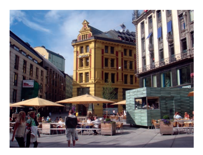
Fig. 2. "Kiosk" – building-sculpture (arch. Snøhetta, realization in 2005) in Karl Johans Gate w Oslo of minimalist form which is contrasted with the 19<sup>th</sup>-century buildings

II. 2. "Kiosk" – budynek-rzeźba (arch. Snøhetta, realizacja 2005 r.) na Karl Johans Gate w Oslo o minimalistycznej formie zestawionej z XIX-wieczną zabudową