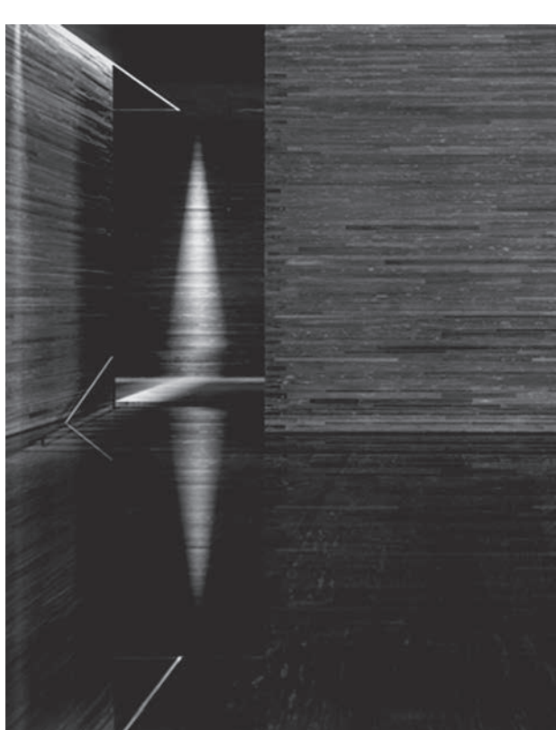
Fig. 3. Therme Vals in Vals, designed by Peter Zumthor, photo by Helen Binet. Source: http://www.wallpaper.com/gallery/art/helene-binet