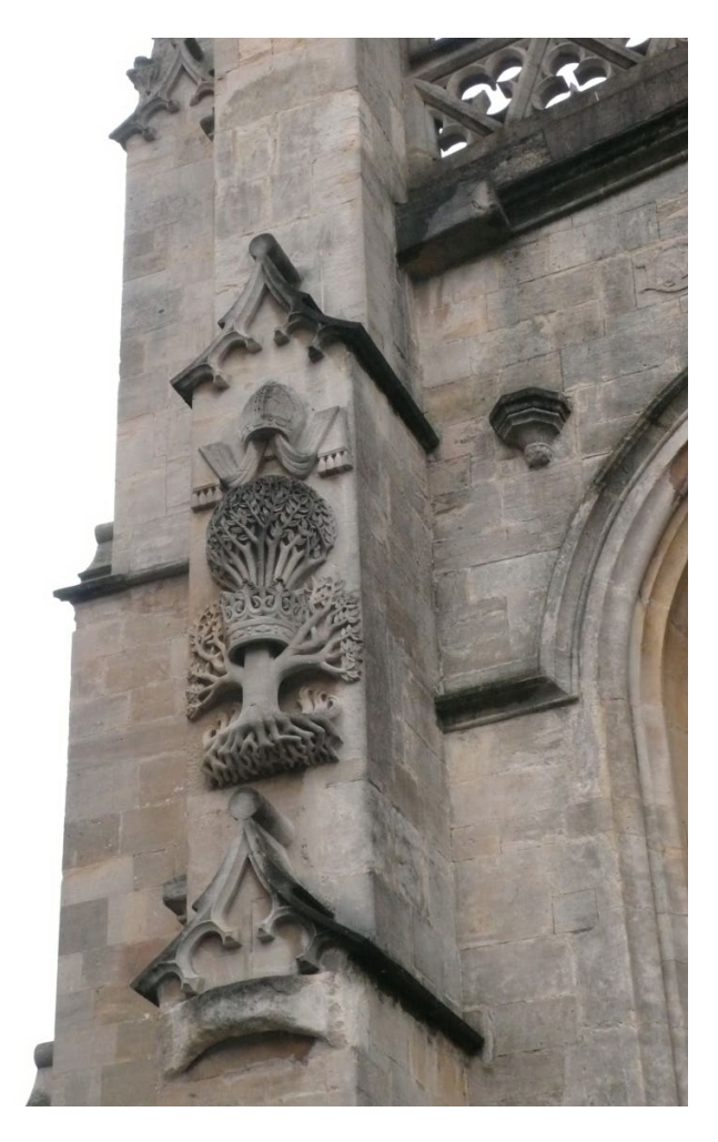
Fig. 6. Cathedral in Bath, west front, relief symbolizing Bishop Oliver King 2009

II. 6. Katedra w Bath, elewacja zachodnia, relief symbolizujący bp. Oliviera Kinga 2009