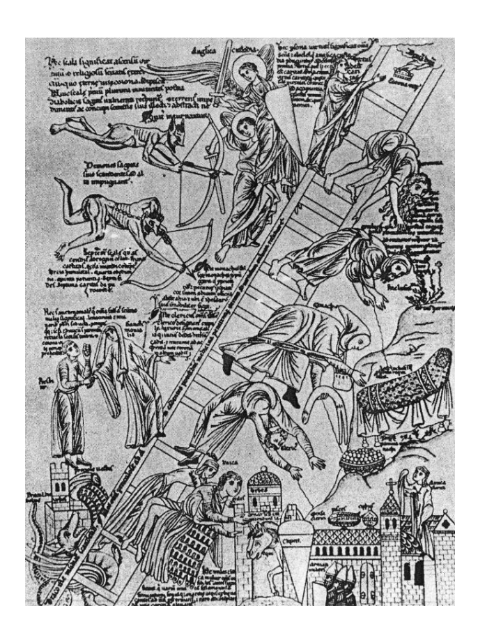
Fig. 4. The ladder of virtues in Hortus Deliciarum by Herrad of Landsberg, 2nd half of the 12<sup>th</sup> century

II. 4. Drabina cnót w kodeksie Hortus Deliciarum Herrady z Landsbergu, 2 poł. XII wieku