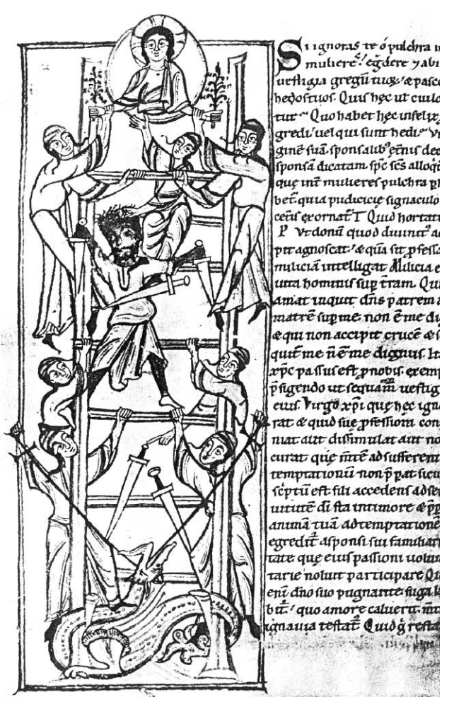
Fig. 5. The ladder of virtues, treatise Speculum Virginum, 2nd quarter of the 12th century

Il. 5. Drabina cnót, traktat Speculum Virginum, 2 ćw. XII wieku