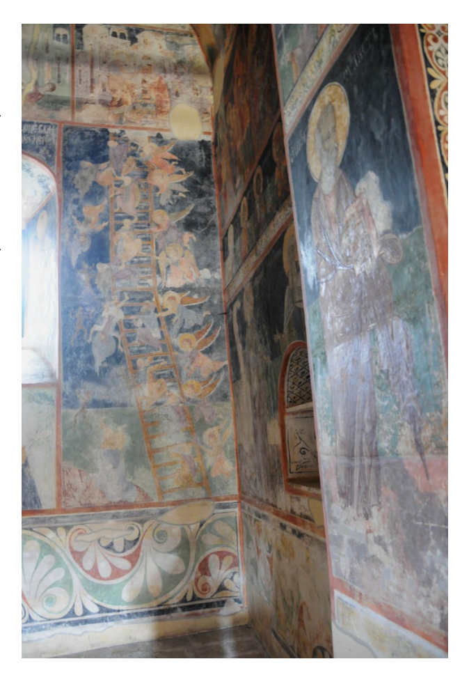
Fig. 3 Montenegro, Pivski Monastyr, fresco with the ladder of virtues on the north wall of the narthex 2009