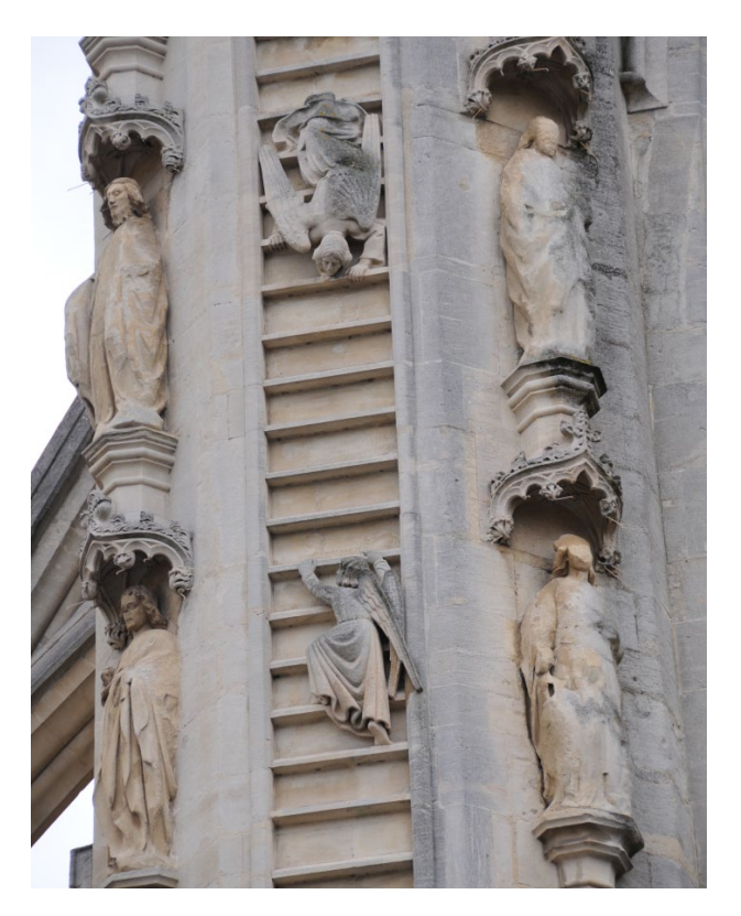
Fig. 2 Cathedral in Bath, west front, fragment of the ladder of virtues on the north side 2009

II. 2. Katedra w Bath, elewacja zachodnia, fragment drabiny cnót po stronie północnej 2009