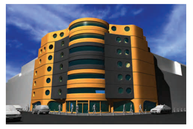
Fig. 7. Object C4 (colour: orange/black) – preferred as a shopping mall II. 7. Obiekt C4 (kolor: pomarańczowy/czarny) – preferowany jako galeria handlowa

II. 5. Obiekt C3 (kolor: pomarańczowy/czarny) – niepreferowany jako miejsce zamieszkania