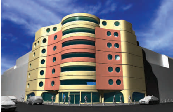
Fig. 6. Object A4 (colour: sandy/beige red) - preferred as a shopping mall

Il. 6. Obiekt A4 (kolor: piaskowy/beżowoczerwony) – preferowany jako galeria handlowa