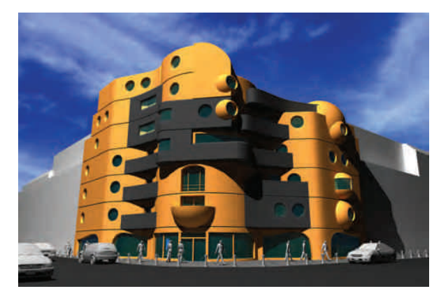
Fig. 5. Object C3 (colour: orange/black) – not preferred as a dwelling place

II. 5. Obiekt C3 (kolor: pomarańczowy/czarny) – niepreferowany jako miejsce zamieszkania