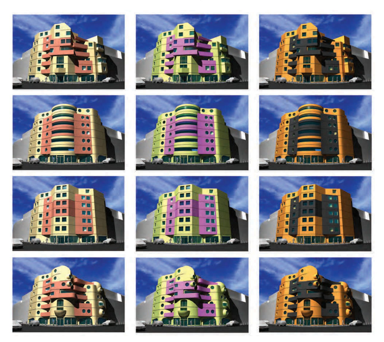
Fig. 2. Twelve evaluated 3D models of architectural objects (controlled formal characteristics) II. 2. Dwanaście badanych modeli obiektów architektonicznych (kontrolowane cechy formalne)

arcade on the other. We wouldn't be able to find out whether the real source of attitude variability (i.e., in other words: the basis of evaluation) are colours, shapes and other features of a building appearance or, for example, meanings strongly connected with the building, its scale or the existing elements of surroundings. If we wish to find out how important the object's appearance is, we need to control and possibly eliminate all the other, apart from features of appearance, potential confounders at the same time maintaining the situational reality, cf., e.g. [15, pp. 395–396], [21]. Therefore, in the photographs of the examined objects there are people and cars. And again, in order to reduce disturbances, the people and the cars were identical in all of the photographs with the same positions, colours, etc.