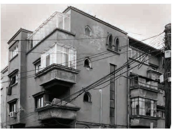
Fig. 11. Modern body of the building and historicizing detail

II. 10. Przykłady modernistycznych domów w Bukareszcie