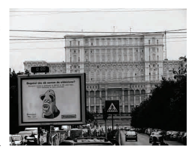
Fig. 12. The Palace of the Parliament (former People's House) at the closing of the viewing axis

The schematic and monumental architecture of these buildings is a combination of socialist realism, a sort of Ricardo Bofill's European post-modernism and the style of official building in North Korea, with which the dictator maintained close relations (Fig. 13).