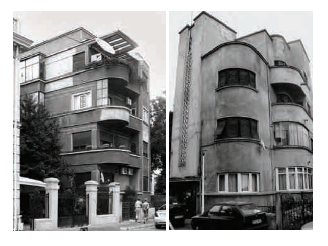
Fig. 10. Examples of modern houses in Bucharest

Il. 9. Współistnienie modernizmu i eklektyzmu