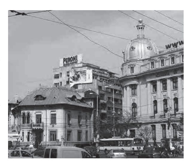
Fig. 1. Neo-Romanian style, modernism and eclecticism in architecture of Piaţa Romăna

a myriad of directions which formed under the influence of Western European ideas. On the other hand, the picturesque disorder of Bucharest and the magnificence