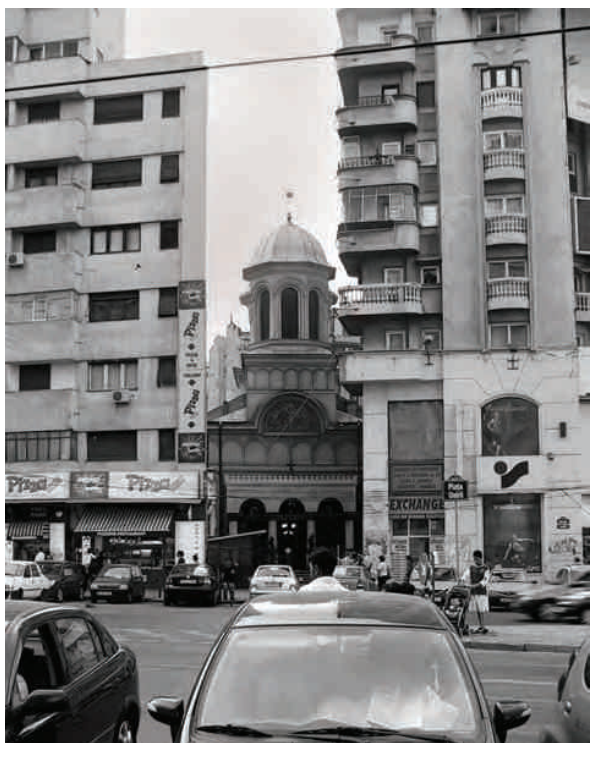
Fig. 14. Historic Orthodox Church hidden among socialist architecture around Piata Unirii

Ceauşescu's activities resulted in irreversible changes in the face of Bucharest. The diverse historic landscape of the city was replaced with a monotonous and oversized urban design. The only remains of the destroyed district are its historic orthodox churches and monasteries which for ideological reasons were blocked by new buildings or hidden inside the quarters (Fig. 14).