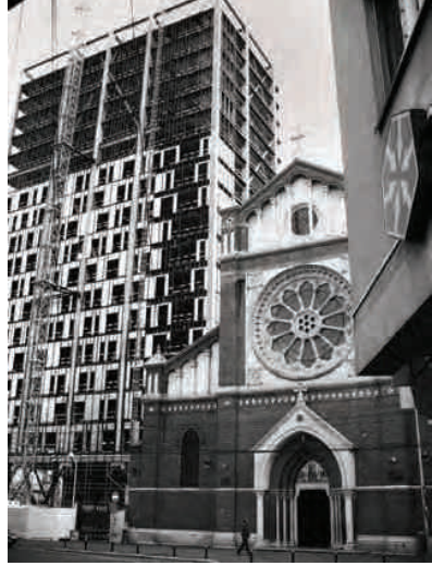
Fig. 15. Controversial investments by the Catholic Cathedral and Armenian Church

Il. 15. Kontrowersyjne inwestycje przy Katedrze Katolickiej i Kościele Ormiańskim