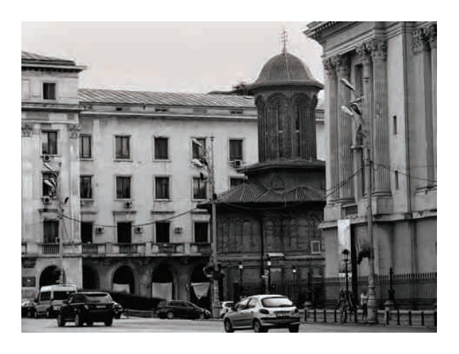
Fig. 3. Kretzulescu Orthodox Church (1720–1722) in the Revolution Square

At the beginning of the 20th century, after a period of uncritical fascination with the Western European patterns, these buildings inspired the architects who wished to express the national ideas (Fig. 4). One of the most prominent repre-