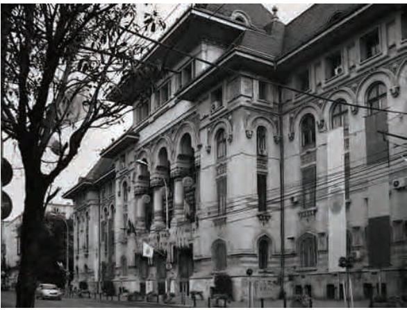
Fig. 4. Town Hall in Bucharest (1906–1910) designed in the Neo-Romanian style by Petre Antonescu (photo: W. Januszewski)

Il. 3. Cerkiew Kretzulescu (1720–1722) na placu Rewolucji (fot. W. Januszewski)