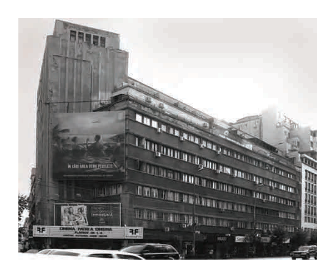
Fig. 8. Modern architecture of Bulevardul Magheru – ARO insurance building from 1929 – designed by Horia Creanga

cultural life at that time. Its advocates gathered around Contimporanul – a magazine published between 1924 and 1934. It was a forum for the young generation of designers who adopted the ideas of architecture of the Bauhaus, Le Corbusier or de Stijl. Hundreds of new buildings in the