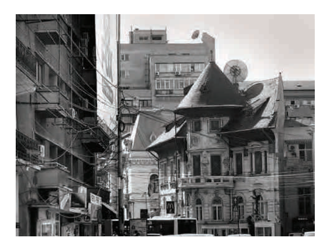
Fig. 2. Diversified architecture of Bucharest center

Il. 2. Zróżnicowana zabudowa śródmieścia Bukaresztu