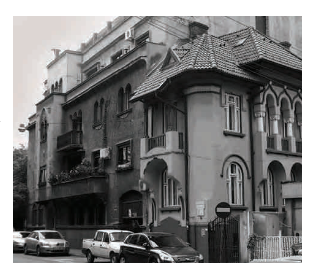
Fig. 5. In the foreground, Neo-Romanian city house; in the background, modern building with details inspired by indigenous style

The indigenous style has numerous variations which vary depending on the moment of origin and the architect's ingenuity. Apart from academic examples of the Neo-Romanian school, the indigenous elements were introduced selectively into eclectic architecture and even modern designs from the 1930s (Fig. 5).