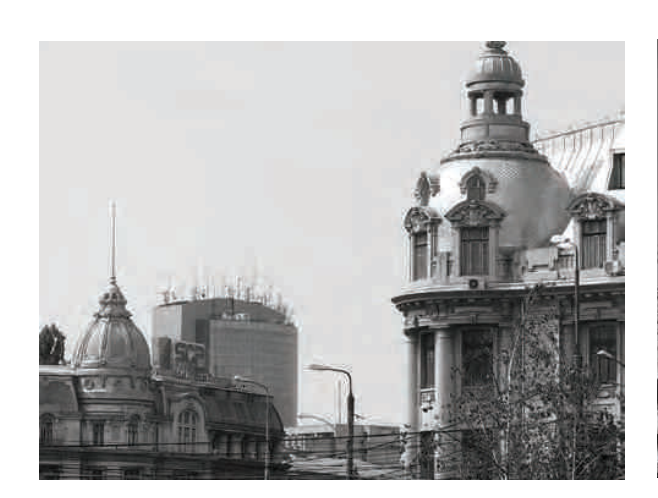
Fig. 6. Eclectic architecture of Piaţa Universităţii

Over the last two decades of the 19th century, a number of representative buildings of public utility and government administration were erected in the area of the