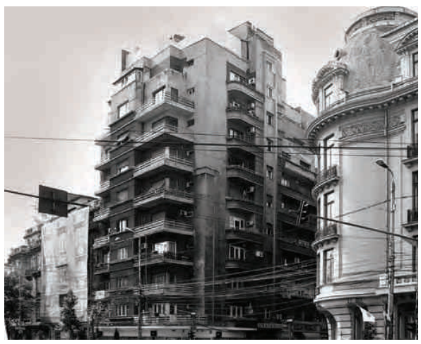
Fig. 9. Coexistence of modernism and eclecticism

II. 8. Modernistyczna zabudowa Bulevardul Magheru – budynek towarzystwa ubezpieczeniowego z 1929 r. – arch. Horia Creanga