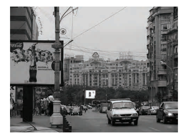
Fig. 13. View of former "Socialist City" II. 13. Widok dawnego "Miasta Socjalistycznego"

Ceauşescu's activities resulted in irreversible changes in the face of Bucharest. The diverse historic landscape of the city was replaced with a monotonous and oversized urban design. The only remains of the destroyed district are its historic orthodox churches and monasteries which for ideological reasons were blocked by new buildings or hidden inside the quarters (Fig. 14).