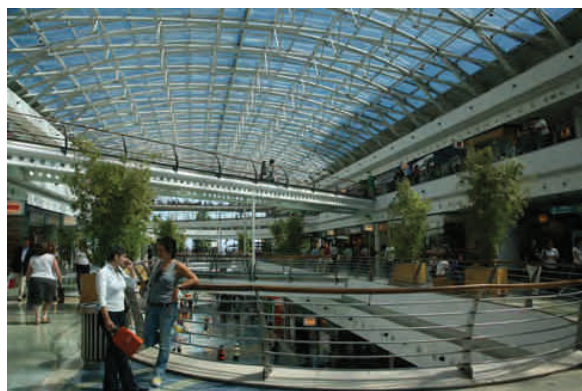
Fig. 2. Lentos Museum of Contemporary Art, interior, designed by Weber & Hofer, 2003

exceptionally attractive with a green Poestling hill and its villas as well as the castle visible in the distance slightly descending towards the river on one side and a panorama of old Linz on the other side. The modern context was determined primarily by two structures built earlier – the neighboring building of Ars Electronica Center and Lentos Museum located slightly to the east on the other bank of the Danube.