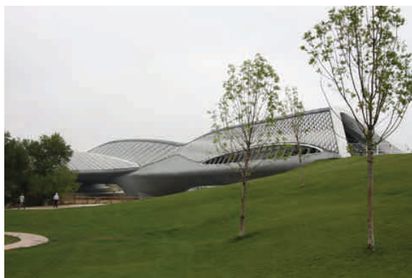
Fig. 4. Ars Electronica Center, designed by Treusch Architecture, 2008

The whole complex, combining the functions of a museum, an exhibition hall, offices and a cafe, has the gross area of 10,557 m 2 . Due to its open spaces and the proper location of skylights the building can be ventilated in a natural way. The double facade improves the conditions inside the building and prevents overheating in the summer and excessive cooling in the winter.