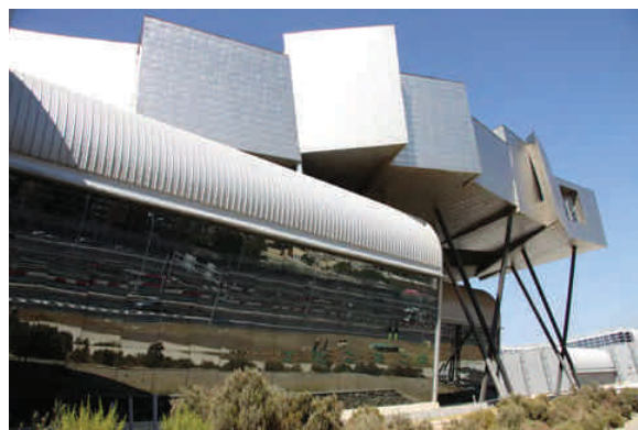
Fig. 3. Ars Electronica Center, view from the Nibelungen Bridge, designed by Treusch Architecture, 2008

Il. 2. Muzeum Sztuki Współczesnej Lentos, fragment wnętrza, proj. Weber & Hofer, 2003 r.