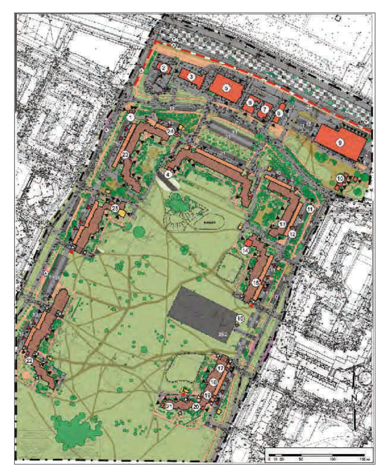
Fig. 1. Plan of current development of part of Gadów Mały housing estate in Wrocław<sup>7</sup>

a thorough analysis of both the functional and spatial issues. First of all a sufficient number of parking spaces should be secured on properly designed parking lots - in this specific case underground structures are suggested. A completely new layout of roads and walkways in between the apartment buildings, including bicycle lanes - should be designed with the use of adequate surface materials. The area in question should be divided into different zones for leisure activities (e.g. playgrounds, skatepark, mini sports fields, etc.) and for passive recreation (e.g. contemplation places,) keeping in mind they should be used by people at different age. It is suggested that the existing elements of street furniture (e.g. lamps, benches, garbage cans, etc.) be removed as they have no value whatsoever and replaced with new elements with more interesting forms. In respect of green areas, the existing plants should be kept and maintained, if possible, and new plants should be selected in such a way as to encourage the residents to spend time together in the open air.