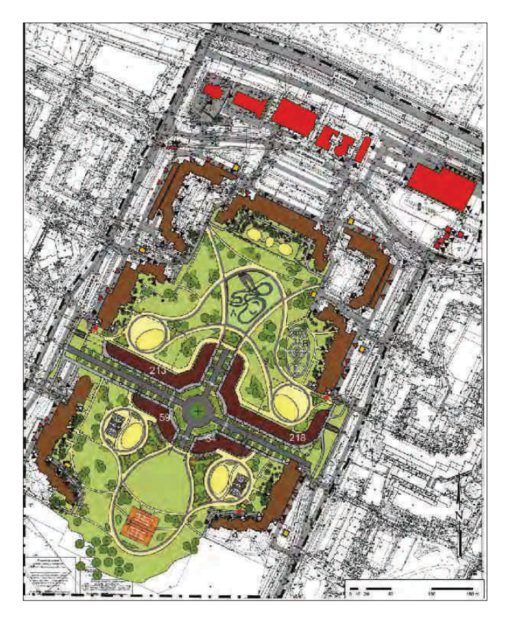
Fig. 3. Conception II – plan of the housing estate in question developed in compliance with the provisions of the local development plan, source: [3, p. 94]