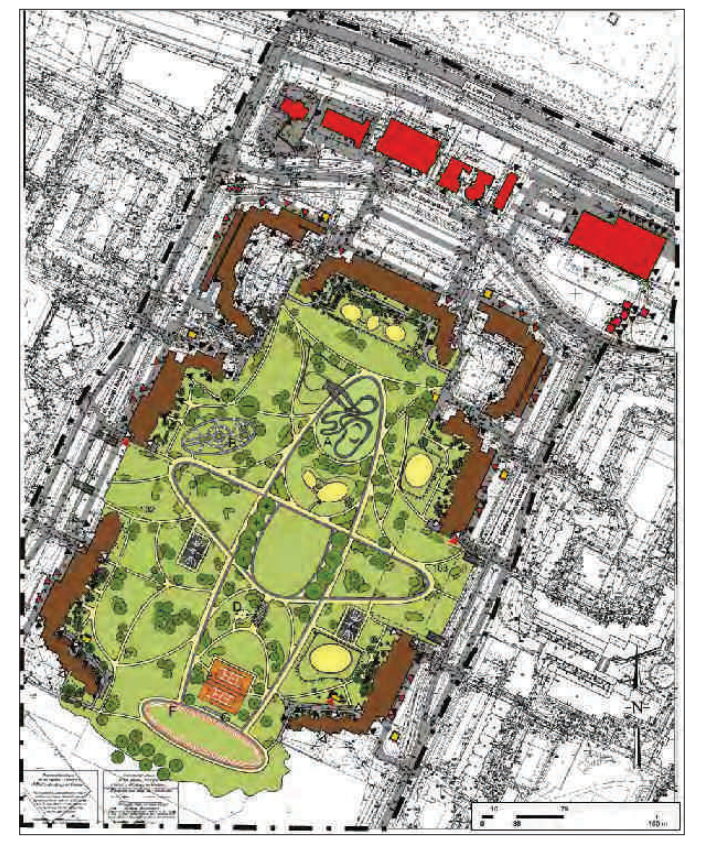
Fig. 2. Conception I – plan of the area of the housing estate in question developed on the basis of conducted historical and field analyses, source: [3, p. 86]

mand for parking space, two underground parking garages were suggested - located symmetrically to each other: in south-east and south-west parts of the area, in the broadest space between the buildings, with entry driveways from Drzewieckiego and Bajana Streets. Next, a new layout of internal roads and walkways, resembling an airplane from a bird's eye view, was designed, which undoubtedly alludes to the former function of that area i.e. an airport. The main footways were designed in the shape of an airplane, others - more or less symmetrically, depending on needs and directions (pedestrian circulation). The whole area of the design, except for transportation system connections, was divided into several recreation zones, depending on the users' needs and their age groups. The area of the existing skatepark was extended by introducing a more difficult layout of paths and more obstacles (A) (Fig. 2). A traffic park (B) would be very popular and appreciated by a little younger children, where they would learn about the basic traffic regulations. The south part of the area has predominantly recreation and sports facilities. A running track (F) with stands (G) was designed in the airplane tail, and two basketball courts symmetrically right under its wings (C). Two tennis courts are visible north of the track (E), and an area with tables for board games above them, between the basketball courts (D). Several of different size play-