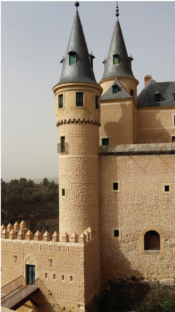
Fig. 2. The Alcázar in Segovia

The 15 th century was probably the period when the “first sgraffito” was created, the decoration began to be “separated” from the stone base and forms similar to Gothic masquerade such as drops or “fish bladders” were used. This type of decoration has been preserved in the patio and tower of the Casa de los Picos [5, p. 190]. Further development of the discussed technique in the 15 th and 16 th centuries led to the use of repetitive, regular motifs placed on the entire façades. At that time, thanks to the Trastamar family, many mudejar decorations were created in the castle chambers. The similarity of the forms and the