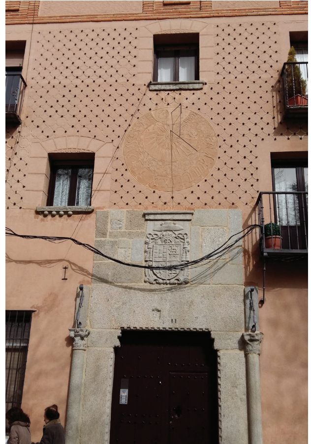
Fig. 7. Sundial on the façade of the house at 11 Plaza la Merced