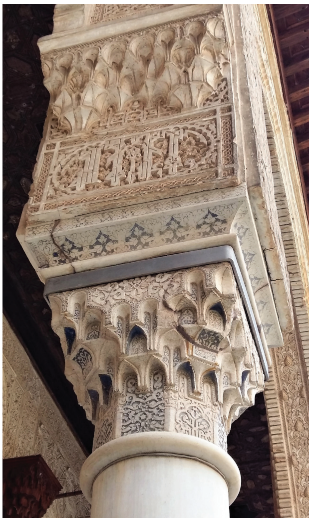
Fig. 1. Various techniques of decoration in arabic architecture – Generalife, Alhambra, Granada

The technique of wall sgraffito has given and still gives many possibilities for formal solutions of façade and interior decoration. Used in both official and residential archi-