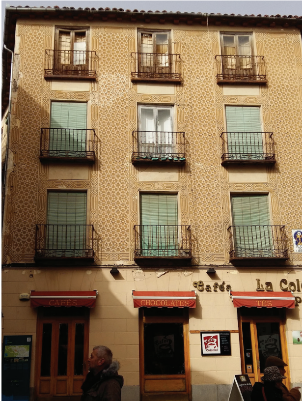
Fig. 8. A late 19 th -century building with decoration on the entire façade, 14 Isabela Católica Street

Il. 8. Kamienica z końca XIX w. z dekoracją na całej fasadzie, ul. Izabeli Katolickiej 14