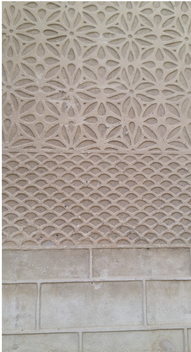
Fig. 5. Sgraffito decoration on the façade of the former farmhouse, now the Municipal Historical Archives, 10 de la Alhongido Street

Il. 4. Palacio del Conde Alpuente przy Plaza Platero Oquendo