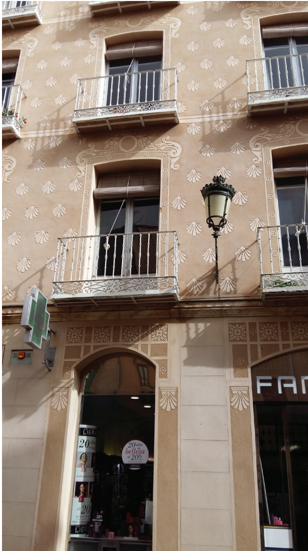
Fig. 6. Sgraffito with seashells on the tenements at 1 Plaza del Corpus and 7 Isabela Católica Street