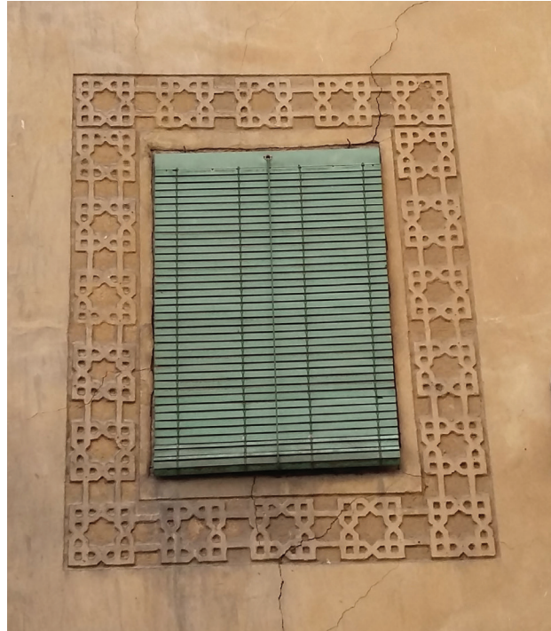
Fig. 9. A banded window with sgraffito decoration, 32 Cervantes Street

As part of the activities to promote "esgrafiado segoviano", geometric motifs from the façades of buildings were used in an interesting way to design the lighting for Christmas 2013. Enlarged stencils of sgraffito fragments, made of lamps placed on racks were located in different places in the old town. This "glowing sgraffito" designed by local artist Adrian Cugar, was an interesting form of reference to urban traditions [28].