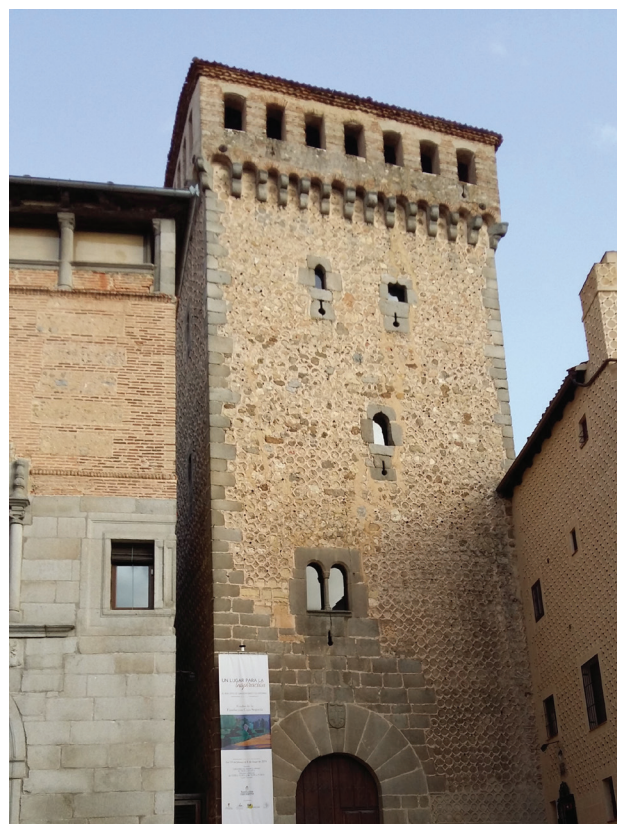
Fig. 3. The Torreón de Lozoya at 5 Plaza San Martín / Plaza de Medina del Campo

The most numerous group are the sgraffito with geometric ornaments, which were made with stencils in the 19 th and 20 th century. By means of various combinations of figures, by reversing the arrangement of stencils in a continuous series, alternately, according to the horizontal or vertical symmetry or by using different arrangements of figures, a lot of heterogeneous combinations were obtained. Motifs imitating stone claddings such as rustication or simple “cuts” of flagstones or other architectural elements are also quite common. Houses covered with