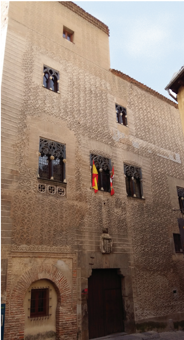
Fig. 4. The Palacio del Conde Alpuente at Plaza Platero Oquendo

Il. 4. Palacio del Conde Alpuente przy Plaza Platero Oquendo