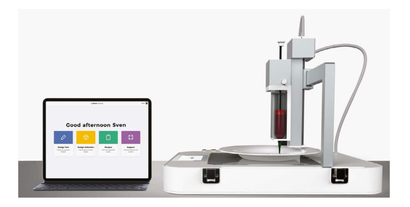
Fig. 2. Focus Food Printer Rys. 2. Drukarka Focus Food

Focus by ByFlow is a portable food printer that uses user-filled syringes to extrude designs onto a static plate. Used in professional kitchens and restaurants geared toward 3D printing, the Focus is a machine that allows chefs, pastry chefs, chocolatiers, and others to customise their products by printing edible objects in molds that are not possible to make by hand or with mould.