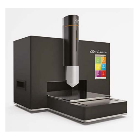
Fig. 3. Choc Creator V2 Plus Rys. 3. Choc Creator V2 Plus

Choc Creator V2 Plus, with the size of a desk and designed to be as user-friendly as possible, takes the tempered chocolate provided by the user, keeps it warm and extrudes it through a stainless steel nozzle designed to come into contact with food.