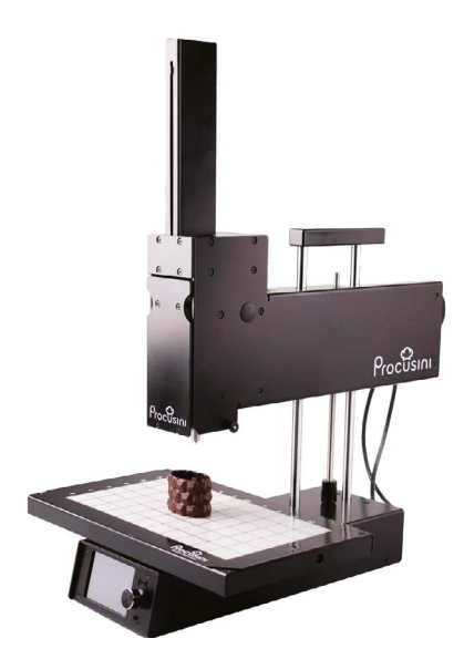
Fig. 6. Procusini 5.0 Rys. 6. Procusini 5.0

of ready-to-print templates, objects, texts and blank models. There are also video tutorials and tips on how to get the most out of this printer on how to make the most of the platform.