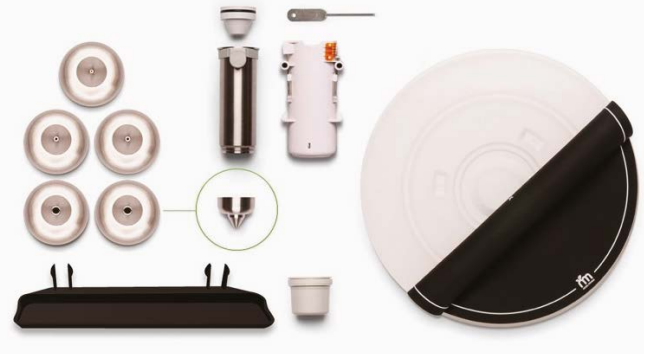
Fig. 5. Foodini 3D food printer and accessories Rys. 5. Drukarka 3D do żywności i akcesoria