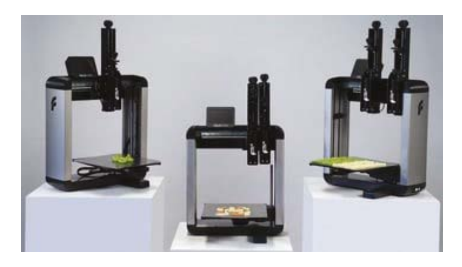
Fig. 4. Felix Food printers Rys. 4. Drukarki Felix Food

of pastes, from vegetable purees to cakes and chocolates, each with precision and speed. Felix Food printers enable food creations, both at home, in a restaurant and as a research tool.