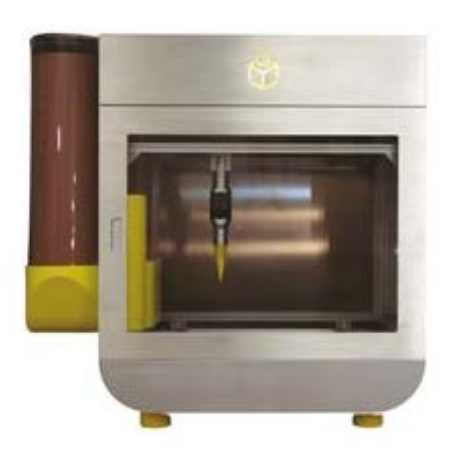
Fig. 8. Patiss3 Rys. 8. Patiss3

The new (September 2022) printer from Parisian company The Digital Patisserie (La Pâtisserie Numérique) uses a powder-based process that makes it possible to work with classic puff pastry recipes, without any additives.