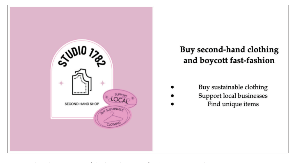
Figure 3. The advertisement of the brand concept for the experimental group