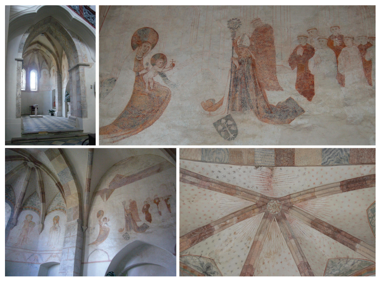
Fig. 13. Painting decoration of the interior of the eastern chapel of the church in Žďár II. 13. Dekoracja malarska wnętrza kaplicy wschodniej kościoła w Žďárze