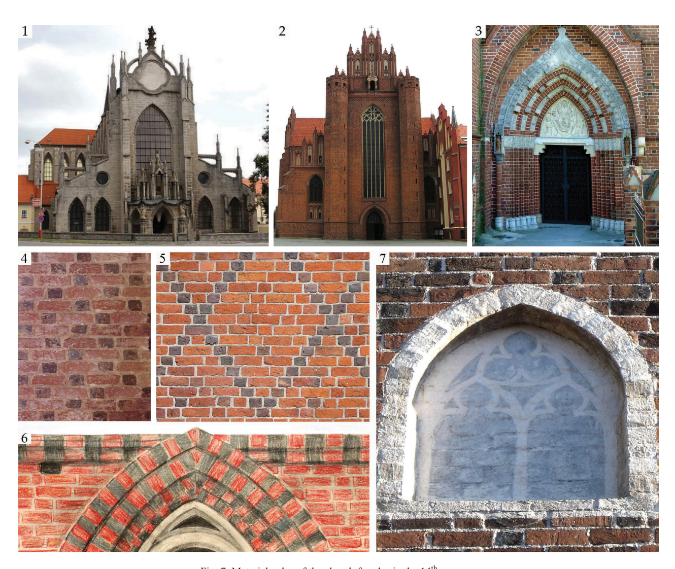
Fig. 7. Material color of the church façades in the 14<sup>th</sup> century: 1 – Sedlec (photo by K. Charvátová), 2, 3, 5 – Pelplin, 4 – Lubiąż, 6 – polychrome in Henryków (photo and elaborated by E. Łużyniecka), 7 – painting in Oliwa (photo by A. Piwek)

II. 7. Kolorystyka elewacji kościołów w XIV w.: 1 – Sedlec (fot. K. Charvátová), 2, 3, 5 – Pelplin, 4 – Lubiąż, 6 – polichromia w Henrykowie (fot. i oprac. E. Łużyniecka), 7 – malowidło w Oliwie (fot. A. Piwek)