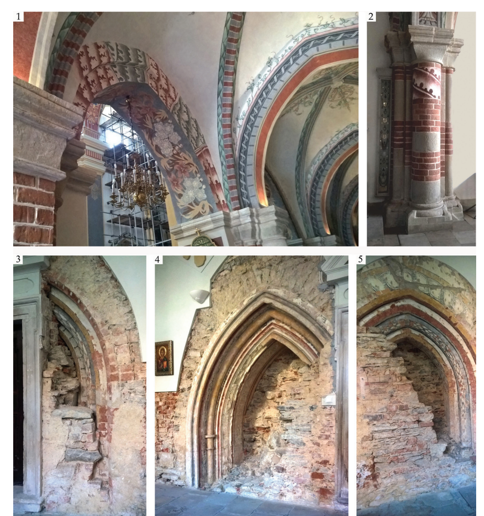
Fig. 9. Decorations of the interior. The monastery church in Mogiła: 1 – arcades and vaults, 2 – engaged column. The chapter house in Henryków: 3, 5 – relics of open works, 4 – portal II. 9. Polichromie wnętrz klasztornych. Kościół w Mogile: 1 – arkady i sklepienia, 2 – kolumna przyścienna. Relikty kapitularza w Henrykowie: 3, 5 – przeźrocza, 4 – portal

of arcades between the bays of the southern aisle of the church in Mogiła. It was accompanied by gray stripes with dark and light shades as well as red-brown stripes. Similar colors were used in the decoration of the vaulted ribs in the aisle in question. The profiles of ribs were painted with gray-green and red-brown stripes which were separated by white lines. This striped composition was enriched with a deciduous ornament. It should be added that the described paintings were later supplemented twice. In the 16<sup>th</sup> century, the vaults were decorated with delicate floral ornaments and in the 19<sup>th</sup> century, the arches of arcades were filled with representations of plant tendrils with large flowers.