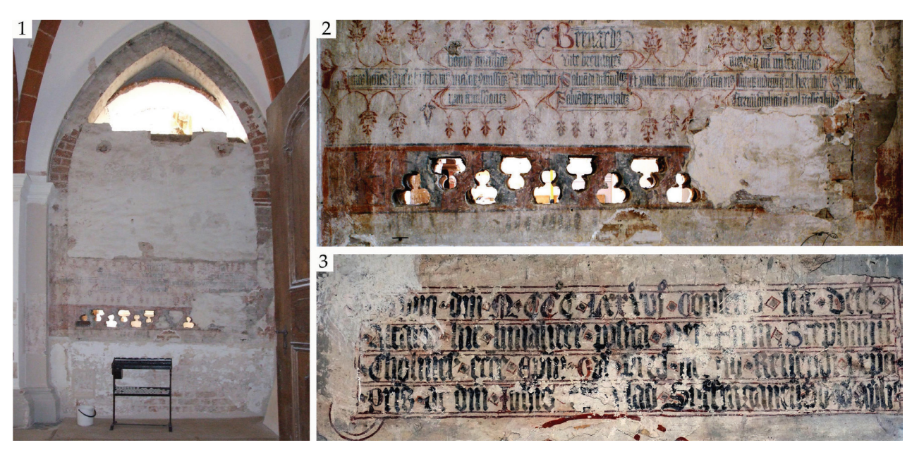
Fig. 11. Inscriptions in the interiors of monastery churches: 1, 2 – Paradyż (photo by E. Łużyniecka), 3 – Oliwa (photo by A. Piwek). II. 11. Inskrypcje w kościołach: 1, 2 – Paradyż (fot. E. Łużyniecka), 3 – Oliwa (fot. A. Piwek).

open work with small three-leaf openings was placed. The openings were decorated with a painting which formed a strip of red and dark gray geometric motifs. The inscription on the wall of the church in Oliwa had a slightly different character (Fig. 11.3). It concerned the foundation of the altar and was a composition of dark gray letters and red lines placed on a white background. There were double red lines between the verses of the text and the corners of the inscription frame were underlined with small circles.