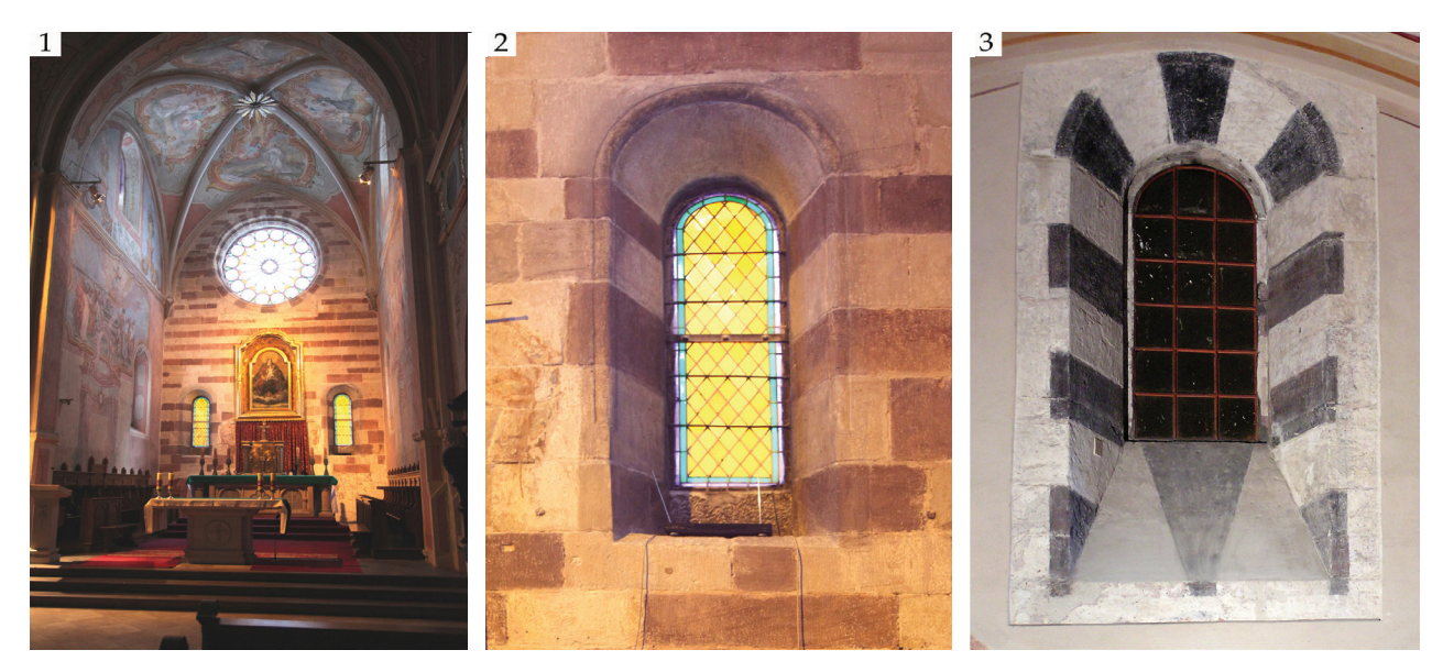
Fig. 3. Material color of the interior of the church in Wąchock: 1 – eastern wall of the presbytery, 2 – presbytery window, 3 – polychrome of the southern aisle window (photo by E. Łużyniecka) II. 3. Kolorystyka materiałowa wnętrza kościoła w Wąchocku: 1 – ściana wschodnia prezbiterium, 2 – okno prezbiterium, 3 – polichromia okna nawy południowej (fot. E. Łużyniecka)

was white, but it was most often used to subtly emphasize selected architectural elements only. This role was played by the joints in the façades of the abbey in Oliwa, Kołbacz and Mogiła – they formed a net of lines between the bricks. In a few cases, small, bright stone elements were used to decorate the arches of openings – for example, in the windows of the church in Mogiła, gray sandstone voussoirs were juxtaposed with red-brown ceramic fittings. A similar principle was applied in the interior of this church. Probably immediately after the construction, the strip layout of the building material was visible in the semi-columns of the aisles. The whiteness of the frieze background plaster in the aforementioned church in Mogiła and the slaked lime of panels in Oliwa were