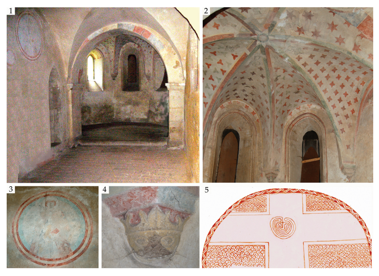
Fig.~6.~Polychromes~in~the~interiors~of~the~monastery~in~Plasy: \\ 1-4-Royal~Chapel~(photo~by~K.~Charvátová), \\ 5-reconstruction~of~the~decoration~of~the~western~portal~of~the~church~E.~Łużyniecka

II. 6. Polichromie we wnętrzach klasztoru w Plasach: 1–4 – kaplica Królewska (photo by K. Charvátová), 5 – rekonstrukcja dekoracji portalu zachodniego kościoła (fot. E. Łużyniecka)