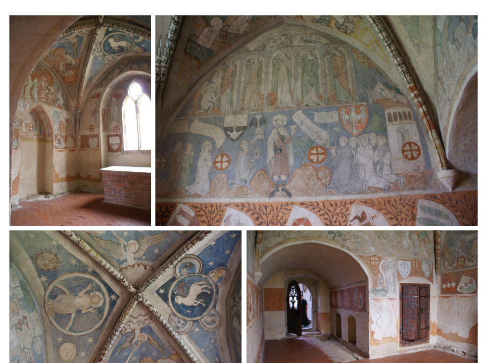
Fig. 10. Monastery in Ląd, painting decoration of St. James the Apostle Oratory in the eastern wing (photo by E. Łużyniecka) II. 10. Dekoracja malarska oratorium św. Jakuba Apostoła w skrzydle wschodnim klasztoru w Lądzie (fot. E. Łużyniecka)