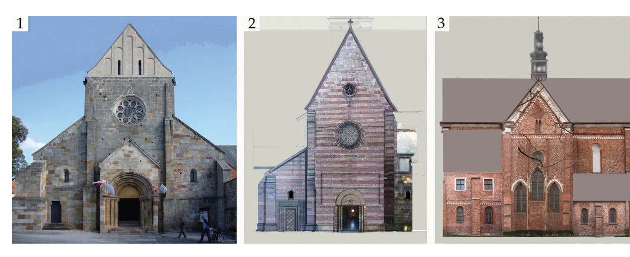
Fig. 2. Material color of the façades of monastic churches: 1 – Sulejów, 2 – Wąchock, 3 – Mogiła II. 2. Kolorystyka materiałowa elewacji kościołów klasztornych: 1 – Sulejów, 2 – Wąchock, 3 – Mogiła