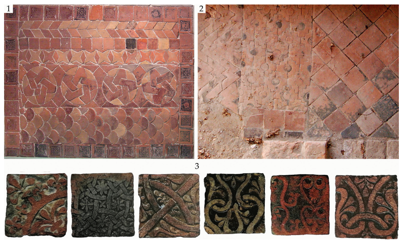
Fig. 4. Floor tiles, re-laid or discovered during excavations: 1 – Wąchock, 2 – Hradiště, 3 – Mogiła

Also in the abbey in Jędrzejów, there were paintings from the 2<sup>nd</sup> half of the 13<sup>th</sup> century, which were preserved in the chapter house that does not exist today. We know