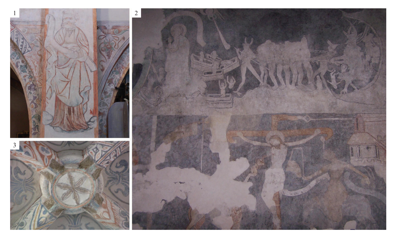
Fig. 12. Painting decorations in the church in Koprzywnica: 1 – nave pillar, 2 – keystone, 3 – presbytery II. 12. Dekoracje malarskie w kościele w Koprzywnicy: 1 – filar nawy, 2 – zwornik, 3 – ściana prezbiterium