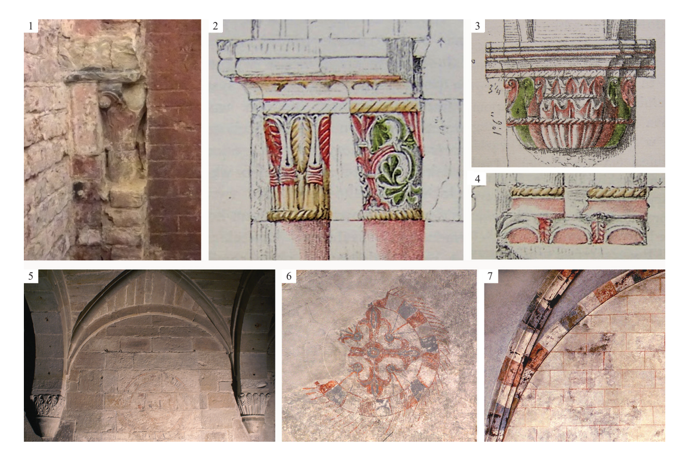
Fig. 5. Polychromes in the monastery interiors: 1 – the arcade of the northern line of chapels in the church in Henryków (photo by E. Łużyniecka), 2–4 – portal little columns and a cantilever in the non-existent chapter house in Jędrzejów (source: [33, p. 108]), 5 – chapter house in Wąchock, 6, 7 – refectory in Wąchock (photo by E. Łużyniecka)

According to this principle, the interior design of the refectory in Wachock, which is dated for the years 1260-1275, was made [34, p. 57]. The walls of the refectory were painted in a light yellow color and against this background there were red lines imitating the construction of the wall. It should be added here that the painted composition did not correspond to the actual location of the joints between dimension stones. On the western wall there is a circle with a tendril of the palmette and the image of a lily, and on the eastern wall - a drawing of a bird. The wall with windows was covered with slaked lime and a light yellow color, and two circles were painted in its upper part. The best preserved is the eastern circle with a lily-shaped cross, filled with light gray, red, blue, and black. The round arches and ribs of the two vaulted bays were painted in light gray, red, light gray, blue, and black