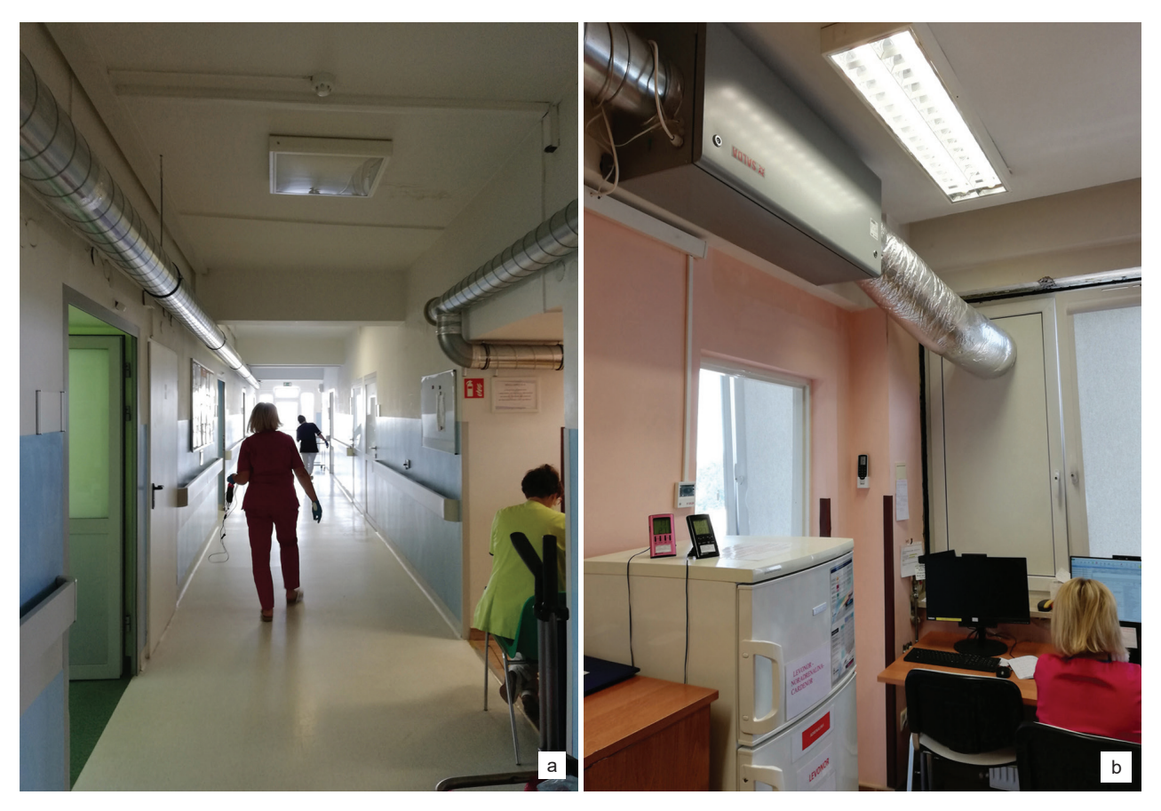
Fig. 2. Hospital in Puławy: a) corridor with visible ducts of mechanical ventilation, b) nurses' station with visible ducts of mechanical ventilation and air-conditioning – limiting ergonomics within the ward