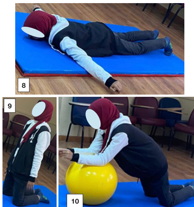
Figure 4. Steps (8, 9, 10) of Pilates exercise

7. Chair expansion: Sit on the mat with your back to the chair. Expand the chest, stabilize the scapula, and place hands on a stepper while raising and lowering the arms.