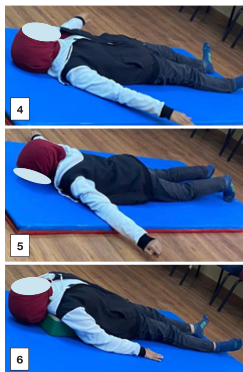
Figure 3. Steps (4, 5, 6) of Pilates exercise

4. Diamond press with lateral arm movement: Repeat the previous exercise but add lateral arm movement to the back extension, as shown in Figure 3.