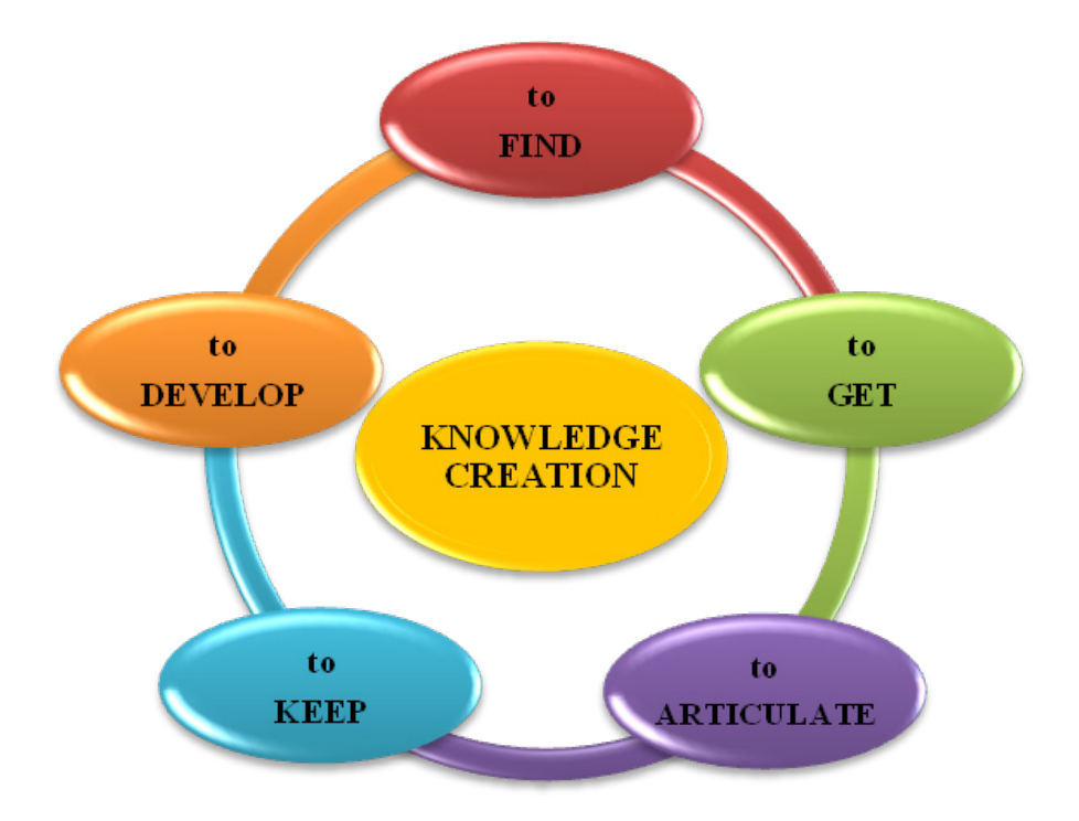
Fig. 1. Knowledge management cycle

As it is a circle, it is not the end of processing, but on every level the knowledge has new derivative form, which is needed to be discovered. In fact, all of those processes support the knowledge creation, which is main issue in that matter (Figure 1).