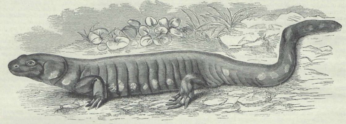
FIG. 16.-An American Eft of the genus Amblystoma.

the faunas of South America and of Australia, but also to a certain zoological affinity between those two regions of the earth, distinct as they are from one another. Thus, as has been mentioned, it is only in Australia and South America that the typical genus Rand is absolutely wanting. One genus of Tree-frogs, Pelodryas, is confined to Australia, but is closely resembled by another genus, Phyllomedusa, which is restricted to South America, and differs from the former only by the absence of a web between