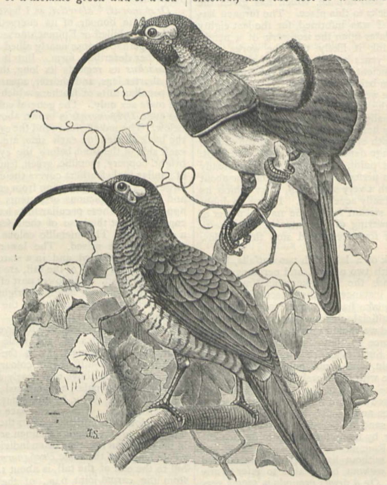
The new Bird of Paradise, Drepanornis Albertisi. Upper figure, Male; lower figure, Female,

dish copper-colour; the feathers of the breast, when laid quite smooth, are of a violet-grey, but when raised, form a semicircle round the body, reflecting a rich golden colour. Other violet-grey feathers arise from the flanks, edged by a rich metallic violet tint; but when the plumage is entirely expanded, the bird appears as if it had formed two semicircles around itself, and is certainly a very handsome bird. Above the tail and wings the feathers are yellowish, underneath they are of a darker shade. The head is barely covered with small round feathers, which are rather deficient behind the ears; the shoulders are of a tobacco-colour, and underneath the throat of a black blending into olive colour; the feathers of the breast are violet-grey, banded by a line of olive, and those of the vent white. The bill is black, eyes chestnut, and the feet of a dark leaden colour. The