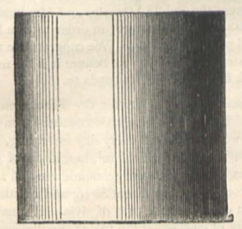
FIG. 12 .- Platinum Kilogram &.

liamentary copies Nos. 1 and 2 of the standard pound, and two auxiliary platinum weights together, equal to about 1432'35 grains. The mean result of 60 comparisons was to find the Kilogramme des Archives epual to 15432'34813 grains. But Prof. Miller was not satisfied with this result, as one of the auxiliary weights was found to contain a small cavity filled with some hygroscopic substance, which rendered its weight slightly variable.