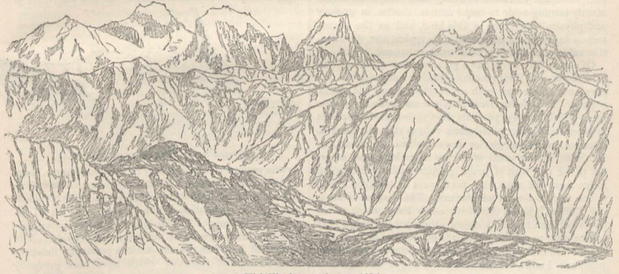
High Himalayan peaks east of Nubra.

Mr. Drew's plan is first in an introduction to present a general view of the Kashmirian territories, and then in succeeding chapters to treat of the various districts. The