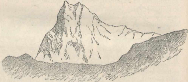
K 2 of Indian Survey, 28,265 feet, as seen from Turmik.

A characteristic and valuable feature of the work is the series of maps which enable the reader to follow satisfactorily all the author's froutes and descriptions. First of all there is a general map on the scale of sixteen miles to an inch, sufficiently minute to enable one to recognise the chief physical features, and in which the various glaciers are indicated. Then come five maps, constructed each from a different and special point of view. The "Snow Map" is coloured, to show the characteristics of