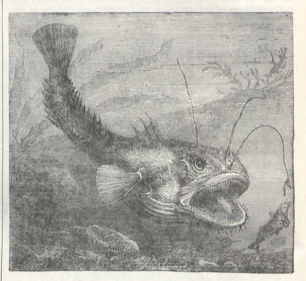
FIG. 2.-Angler (Lophus piscatorius).

"The angler is insatiably voracious, but it is a slow swimmer; it is formed, in fact, for taking its prey in ambush. It reposes on the soft mud or sand, in some favourable lurking-place, and, stirring up the mud with