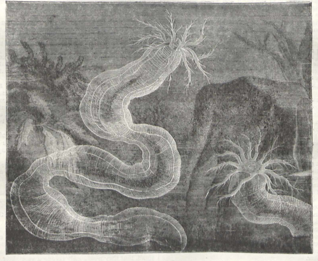
FIG. 3.-Synapta duvernea.

which enabled the Synapta to crawl up the side of a highly-polished vase. In short this creature, denuded to all appearance of every means of attack or defence, showed itself to be protected by a species of mosaic, formed of small, calcareous, shield-like defences, bristling with double hooks, the points of which, dentated like the arrows of the Carribeans, had taken hold of my hands. If one of these Synapta is preserved alive in sea-water for a short time, and subjected to a forced fast, a very strange. phenomenon will be observed. The animal, being unable