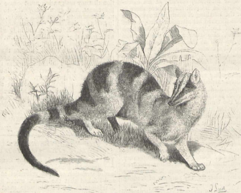
FIG. 17.—Hardwicke's Civet-cat.

So far as has been ascertained from the Zoological