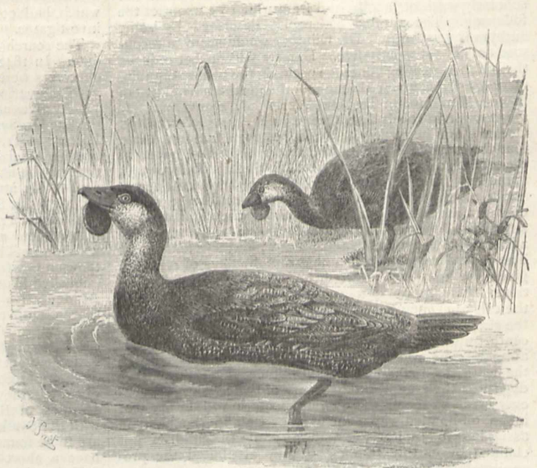
FIG. 19.—The Lobed Musk Duck.

but a seeming one. "There is something about this extraordinary bird," Mr. Gould continues, "which reminds one of the cormorants"; yet no ornithologist