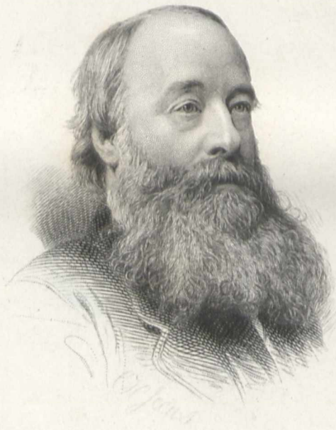
James Prescott Joule.