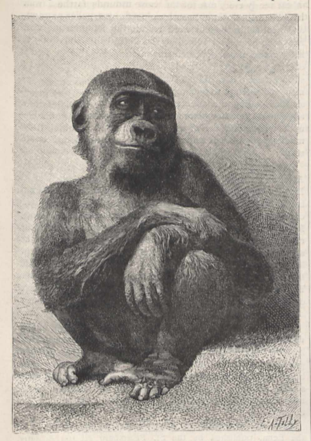
even of the gibbons. Since the above note was presented by Alph. Milne-Edwards to the Paris Academy of Sciences the young gorilla died at the Jardin des Plantes.

His /intelligence was feebly developed, and was in any case quite below that of the other anthropoid apes, or