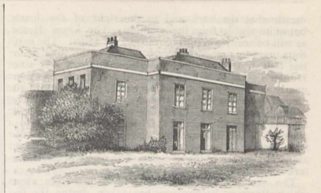
FIG. 1.-Hunter's House. From the meadow.

THE three subjoined drawings are very faithful delineations of some of the portions of John Hunter's house and grounds, at Earl's Court, to which I drew attention in NATURE for Jan. 7. The first drawing supplies the view of the house looking into the meadow, in which view the house is, I believe, nearly the same as it was when Hunter lived in it. The second sketch is that of the Lions' House, or den, situated at the end of the