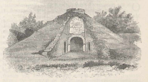
FIG. 2.-The Lions' House.

FIG. 1.-Hunter's House. From the meadow.