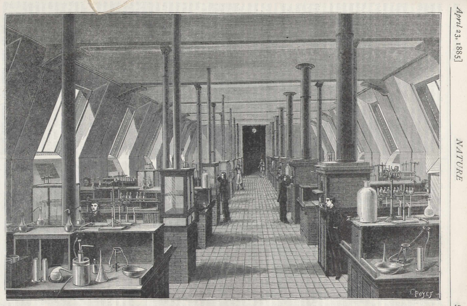
FIG. 2 .-- The New Central School: General View of the Great Laboratory or Third Year Students.