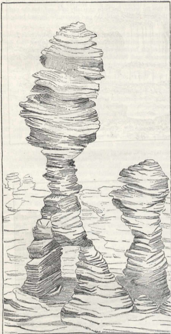
FIG. 3.—Scene on top of Roraima.

From the portion of the cliff we reached we had a good view of the ledge we had seen on the 5th, and, though