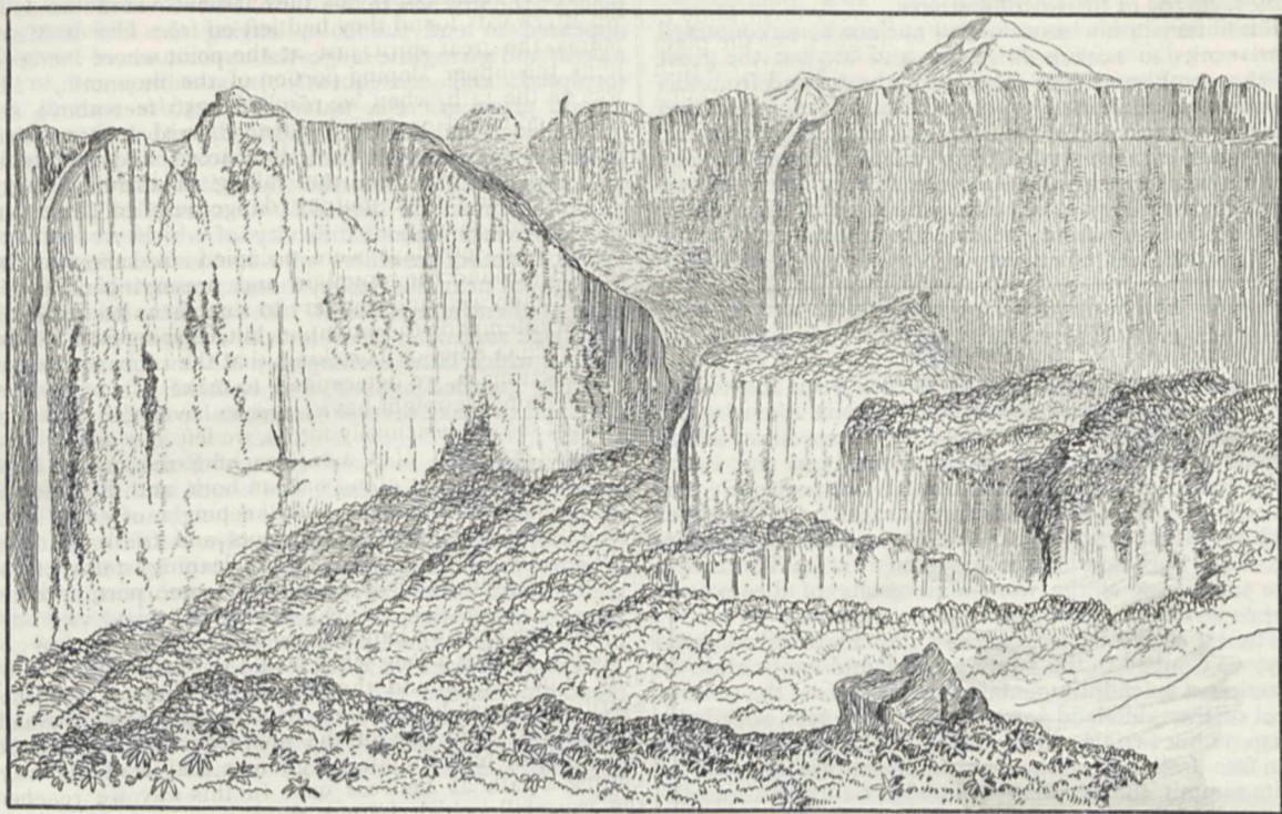
FIG. 1.—Part of south-west face of Roraima, showing ledge by which we ascended.