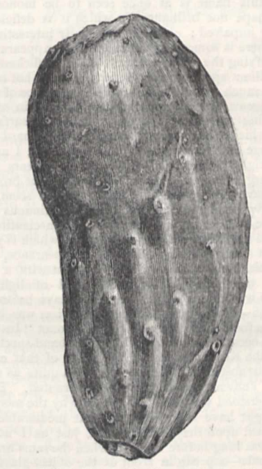
Abnormal Fruit of Opuntia Ficus-Indica from Carácas.

The accompanying figure represents a fruit of Opuntia Ficus-Indica, which is wholly inclosed in one of the well-known flat branches of this plant; normally the fruits appear as exserted obovate bodies on the margin, or on either side, of the branches. The figure is exactly half natural size; the fruit is therefore full grown. There is no interruption in the ascending curves of spinous tubercles, only they are somewhat smaller on the fruit, which has also a less wrinkled skin than the remainder of the branch. It is of rather uncommon occurrence, nobody having seen here anything alike in the extensive tunales or Indian fig-plantations of our neighbourhood; nor have I been able to find any mention of such a case in the books at my disposal. It is evidently an instance of non-development of peduncle, a special case of suppression of axile organs (Masters, "Teratology," p. 393). But I think it throws also some light on the nature of what generally is taken to be the pericarp of the Opuntia fruit, which, after all, seems to be a slightly modified branch, bearing the ovary of the flower in a cavity on its