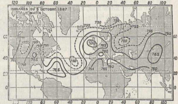
CHART No. 2.

On the 8th a complete change of system occurred; an important depression reached Europe over Portugal, and the low pressure extended over the north of the British Isles. This depression did not fail to bring a storm from the north-east. While the situation in Europe was considered as fairly stable, and the low pressures of the north of Europe were considered to be chiefly in operation, an important minimum which was advancing from the central part of the ocean suddenly appeared, and produced a complete change of conditions. And yet the predictions of the European meteorologists were certainly the only ones that could have been made from the study of the various daily weather reports. But if we construct the chart of the 5th of October, we shall recognize that a centre of low pressure was very close to the south-west of Spain, and was directly threatening Europe. A mere glance at the Chart No. 2 would have been sufficient to