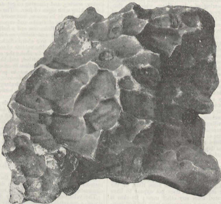
FIG. 1.—Mazapil Meteoric Iron ( \frac{1}{3} natural size), showing thumb-marks.

This crust is usually dull, but sometimes, as in the Stannern meteorite, bright and shining, like a coating of black varnish.