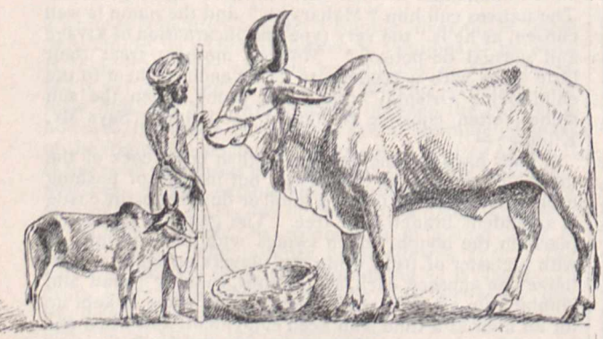
Fig. 2.—Comparative sizes of the largest and smallest breeds of Indian oxen.

"the more you learn about them the more you find to interest you." Fig. 2 represents roughly the range of their size. Even larger beasts than the largest shown sometimes occur. The smallest belongs to a miniature