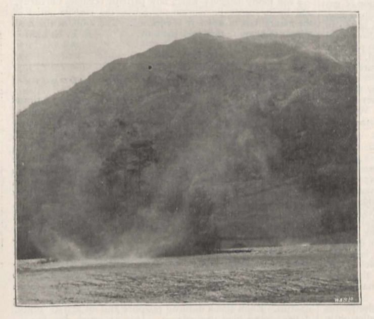
Whirlwind on "Rydal Water," and smaller one in distance, October 16.

Some friends and myself were staying at Lowwood Hotel, Windermere, for a few days, and on Friday, October 16, we were walking by ''. Rydal Water," on the opposite side from the road, when we noticed a very curious and most unusual effect on the water, caused by a sudden very heavy squall of wind, which seemed to come from two directions at one time, creating a '' whirlwind," and raising the water and spray on the lake fully 100 feet high or more. There were eight or ten of these disturbances during the time we stayed (probably about twenty minutes), and I was fortunate enough to have my handcamera with me and to photograph the largest of them, which came sweeping down the lake towards the island (near the