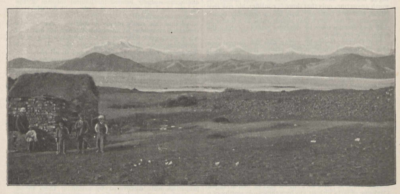
The Andes from Chililaya, Lake Titicaca

THE two first volumes of this work were noticed in NATURE, vol. li. p. 388, and the general remarks made there apply in great measure to the new volume also. We must, however, observe that the highlands of