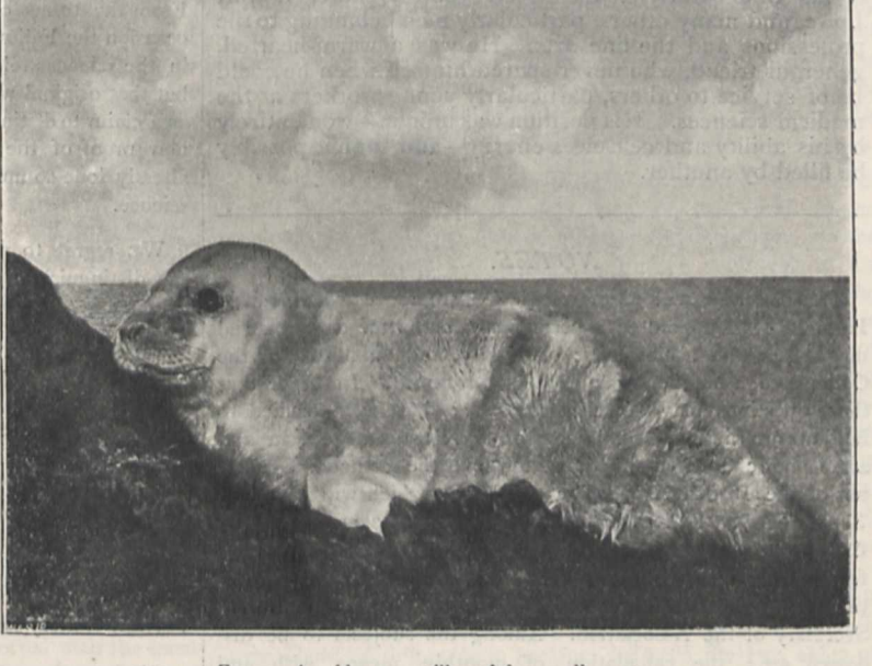
FIG. 2.—An older pup, still retaining woolly coat.

Although he was one of the founders of the Patho-