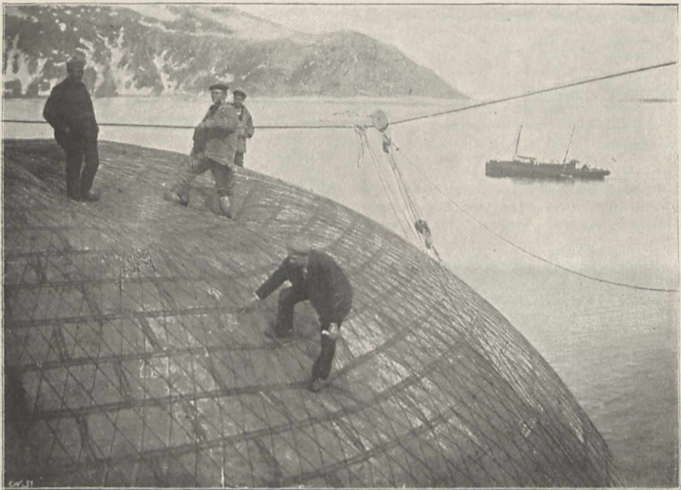
FIG. 1.—The top of the balloon, showing the joinings of the pieces.

The balloon Ornen was constructed as a sphere sixty-six feet in diameter with a conical appendage. It was furnished with two lateral valves for releasing the imprisoned gas at will, a large automatic valve to let the gas escape whenever the internal pressure exceeded a certain limit, and a rending flap intended to be used to prevent bumping on finally alighting, and so constructed