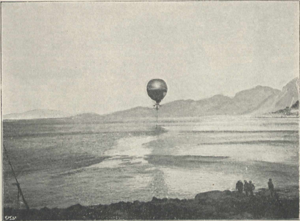
FIG. 2.—The balloon on its departure, showing guide-ropes.

The Faculty wishes to receive a work of real scientific interest in which such questions will be treated in a general intelligent way, and in which a minute examination will be made regarding the admissibility in relation to the appropriateness of the usual mode of representation. Communications may be mathematically or philosophically and psychologically inclined, and historical studies are desired but not demanded.