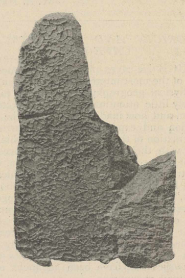
Fig. 2.- Structure of ice surface in contact with rock.

ice. The peculiar form of the network developed, for instance, on the surface of an ice-stalactite, with its radially arranged tiers of "cells," requires further explanation. Lohmann ascribes an important part in determining the arrangement of the "cells" to the expansion and contraction of the ice under changes of temperature. Since the coefficient of expansion of ice is great, the surface when exposed to variations of temperature will undergo a splitting process, which will result in the production of so-called "elementary cells." These will then become crystal units (if not already such) by the process of coalition which Emden supposed to occur, and the ultimate dimensions of the prismatic structure are then