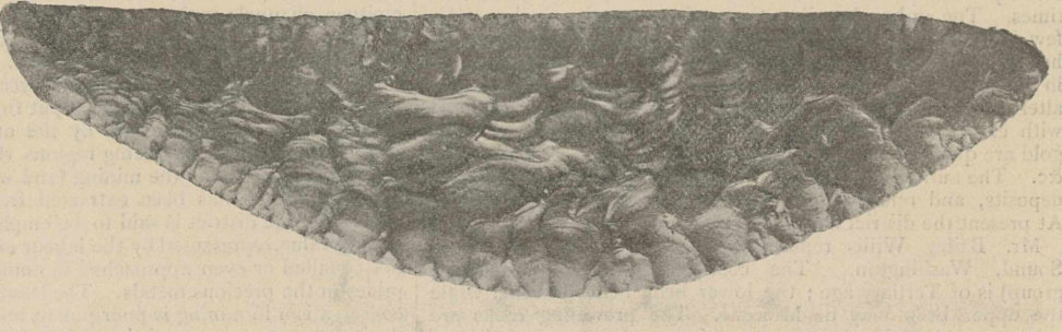
Fig. 2.-Flint knife from Wady el Sheikh.

The addition of an electrolyte may bring about coagulation either by altering the potential of the fluid phase, so as to make it agree with that of the solid phase, or by furnishing "nuclei" about which the particles of solid aggregate. When the particles carry a negative charge, acids act by decreasing the positive charge of the fluid; when the particles carry a positive charge, alkalies act by decreasing the negative charge of the fluid. In these cases the coagulating power of the acid or alkali is directly measured by its chemical activity when dissolved in water. The relation is expressed by the formula