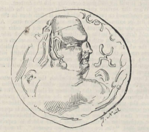
FIG. 2.-Coin of Jayatu Mihirakula (Mo-hi-lo-kiu-lo of the Chinese Annals), last King of the Hûnas; 515-544 A.D.

The Chinese annalists inform us that the Yué-tchi were located in eastern Turkestan, south of the Celestial Mountains, but being invaded by the Hiung-nu in 201 and 165 B.C., they field to the west and spread over Sogdiana and Bactria, and dispossessed the Ta-hia (Tadjiks). The annalist thus speaks of the inhabitants of Sogdiana: "Sunken eyes, prominent nose and bushy beard, they excel in trade," just like the living Tadjiks. The primitively nomadic Yué-tchi became sedentary and prosperous in this fertile country. In B.C. 25 Kieu-tsieu, or Kudschula, whom the Greeks called Kadphises, the prince of the Kuei-schuang (Kushan), one of the five tribes of the Yué-tchi, conquered the four other tribes, and, crossing the Hindu Kush, invaded