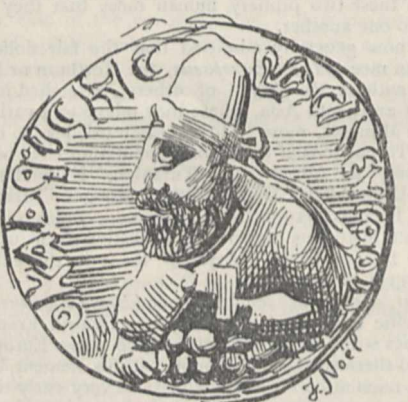
FIG. t .- Coin of Kadphises II., King of the Kushans; circ. 55 A.D.

Nearly two hundred years later we again meet with this ancient form of skull, but with slight modifications. On the very beautiful sarcophagus from Sidon is represented a battle (? of Arbele) between Macedonians led by Alexander and Persians under Mazaios, one of the bravest of the generals of Darius. The main differences between the physical characters of these two nations consist in the head of the Persians being higher and the forehead broader and more vertical than that of the Macedonians. The latter were still characterised by a rather low, flat head, by a rather retreating forehead, and often with prominent supra-ciliary ridges and a well-marked nasal notch. The nose of the Persian is very delicate, but inclined to be arched. Their beautiful eyes are more sunken, but less widely open than those of the Greeks. This superb monument has the inestimable advantage of retaining some of its original coloration, and all the Persians, like the Macedonians, had fair or red hair.