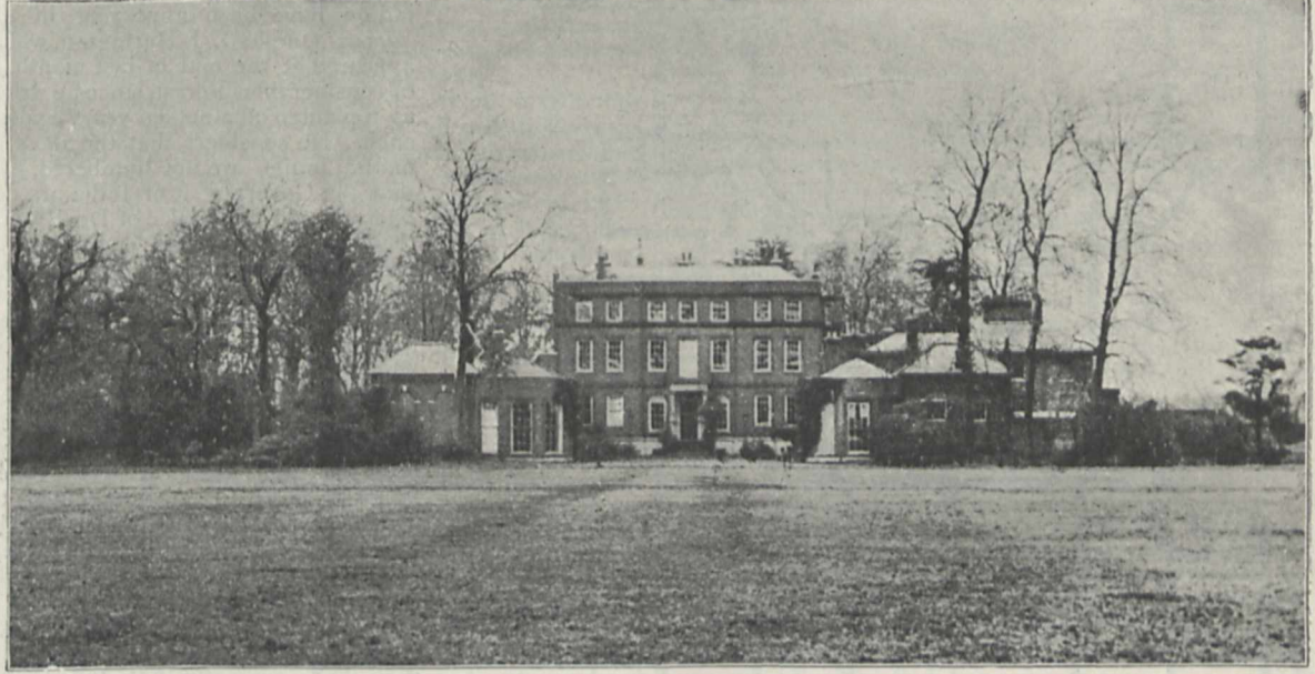
FIG. 1.-National Physical Laboratory. Bushy House from the East.

The grounds of Bushy House, under the direct control of the Royal Society, are nearly twenty-five acres in extent; it will be possible, therefore, to put up, if required, isolated buildings for special experiments; the use, for example, of a large testing machine in the engineering laboratory might shake the physics laboratory, and would certainly disturb many of the experiments in the engineering laboratory itself. At present the funds available are insufficient to permit of the purchase of such a machine; if it is found that one is wanted, and money were forthcoming, the necessary buildings could be erected in another portion of the grounds.