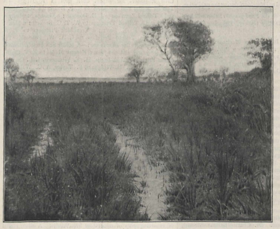
FIG. 2.-Portion of a cultivated area at Lokoja, showing butts and furrows, in the latter of which Anopheles puddles occur.

A REUTER telegram of October 14 from Cape Town states that the Discovery sailed that day from Simon's Bay for Lyttelton, New Zealand.