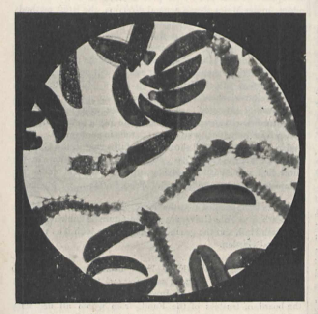
FIG. 1.-Anopheles larvæ in several stages of their cscape from the ova.

worse than useless unless race and age are taken into account.