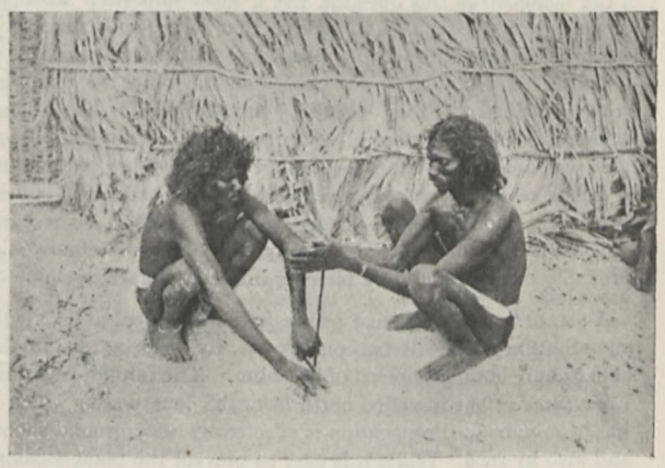
FIG. 1.-Yánádis making Fire.