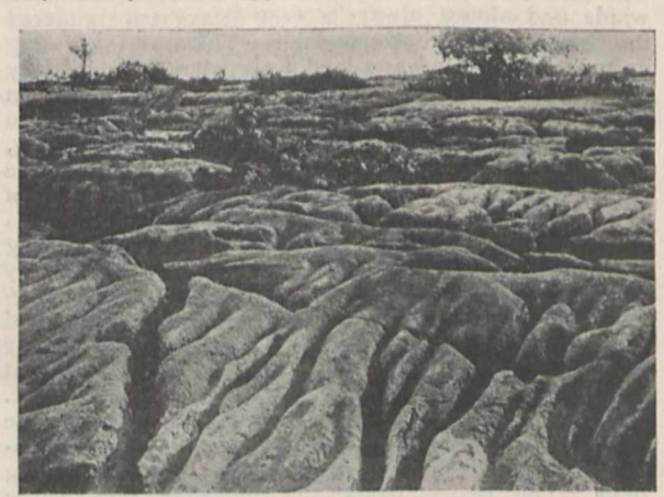
FIG. 2.—Widened joints ("grikes") and rain-gullies in Carboniferous Limestone; Hampsfell, near Grange, Lancashire. The top of Hampsfell, near Grange, presents a weird and desolate aspect. There is no soil, the surface being barren limestone, whereupon but a few stunted bushes contrive to grow. Chemical denudation is at work, every joint and small crack in the limestone is widened, and its edges smoothed off by the solvent action of "carbonated water." The limestone is so pure that little argillaceous matter is left, after solution, to support vegetation, so that instead of the usual soil and grass-covered surface we have an arid corrugated waste, more resembling in appearance the "frozen fury" of a cooled lava-flow than the gentle undulating outlines we are accustomed to associate with weathered surfaces of stratified rocks in these islands. A. S. Reid.

The issue is the first of three, the second of which may be expected to appear before the end of the current