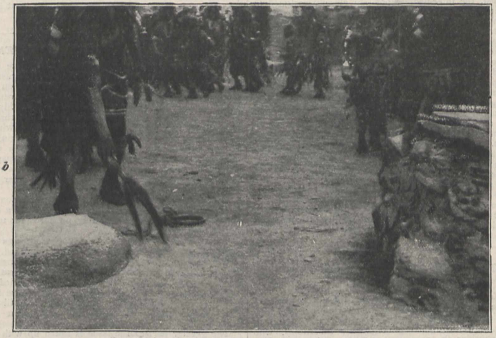
FIG. 3.-Priest using the Snake Whip preparatory to picking up a Snake.

In the paper under notice the authors bring forward what they regard as adequate evidence for assigning a seed to Lyginodendron, perhaps the best known of all Cycadofilices, owing to its admirable preservation and very common