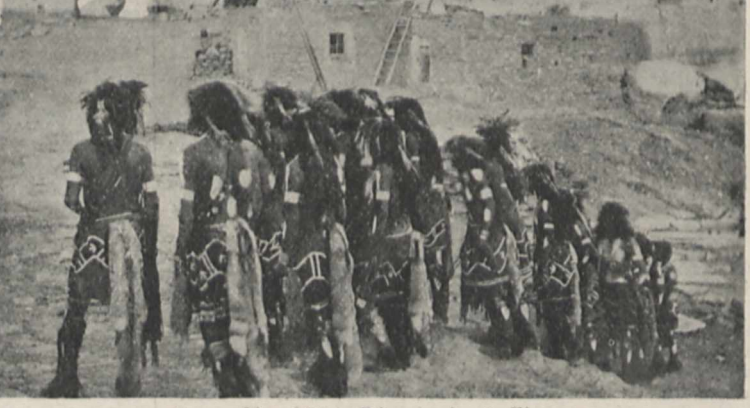
FIG. 2.-Line of Snake Priests leaving the Kiva.

from the great bowls of emetic which produces violent vomiting. The priests now repair to their respective kivas, where they disrobe. In the Snake kiva there is an additional discharming ceremony, followed by a feast, this being the first food the chief priests have taken for four days, and the other priests since the preceding day.