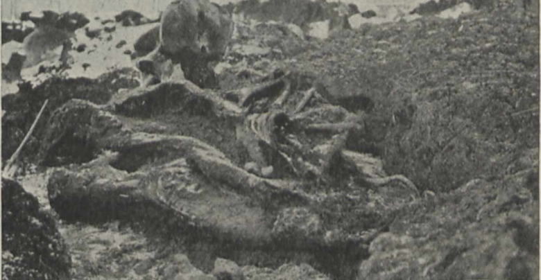
2.—Left and partly posterior view of the same specimen, showing the bent left fore limb and the left hind limb turned forwards beneath the body. FIG.

the skull, and found the well-preserved tongue hang-ing out of the mandible. He also noticed that the mouth was filled with grass, which had been cropped, but not chewed and swallowed. Further examination of the carcase showed that the cavity of the chest was filled with clotted blood. It is therefore natural to conclude that the animal was entrapped by falling