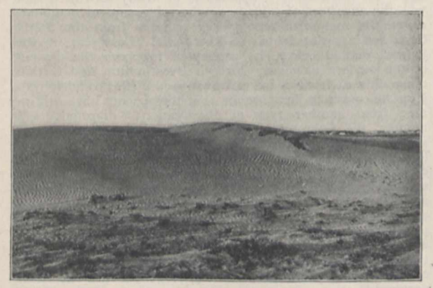
FIG. 1.—Sandhill near Clifton, Karachi, showing change of form and scour by wind.