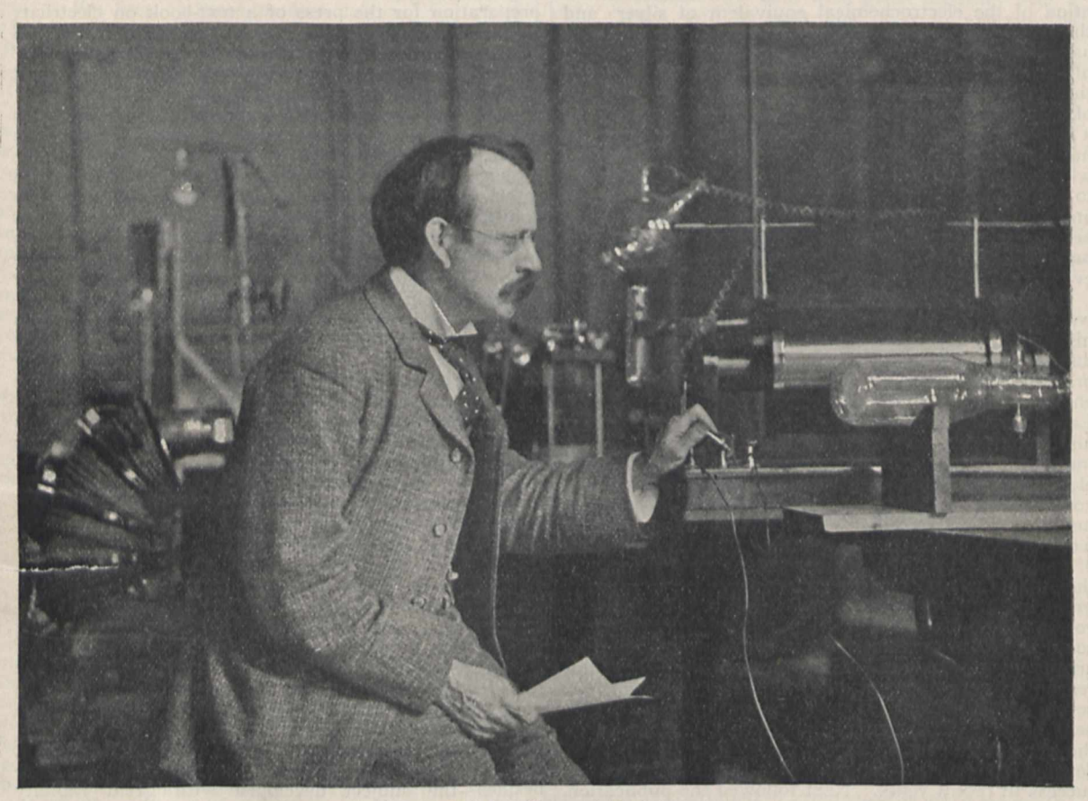
FIG. 1.-Prof. J. J. Thomson in the Laboratory.

This work was followed by a series of investigations in the laboratory on that most complicated of all types of discharge—the passage of electricity through a vacuum tube. Anyone who has witnessed the gradual exhaustion of a vacuum tube from atmospheric pressure to the lowest vacuum cannot fail to have been