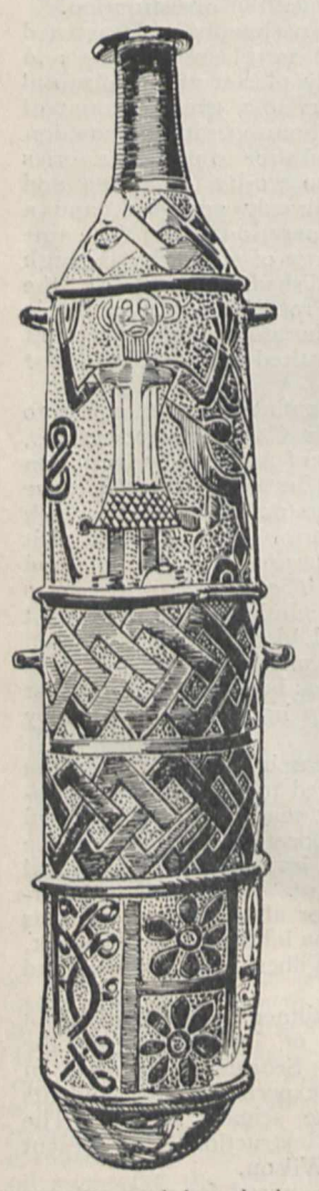
FIG. 1.—Engraved brass bottle, Height 16 in. British Museum. From "Great Benin," by H. Ling Roth.