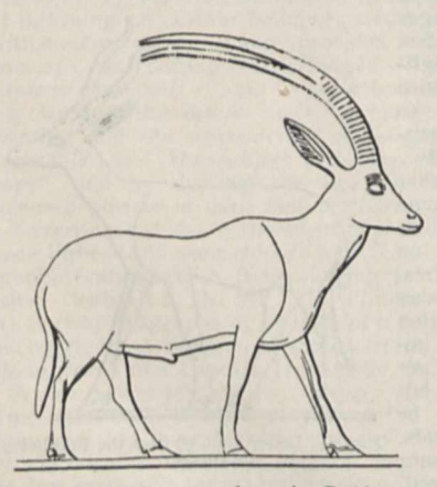
Fig. 5.—White oryx, from the Ptahhetep Chapel. Western Asia, I may in the first place direct attention to an illustration in an illustration in Carrying Gazelle," which is reproduced in the accom-panying cut (Fig. 7). The original slab, which is preserved in the British Museum, was one of those obtained from the palace at Nimroud by Sir Henry I ayard, in whose own work it bears the above-mentioned

two portraits of a hedgehog shown at C in Fig. 6, from the Ptahhetep hunting-scene, one of these representing the animal standing in the open, and the second showing it