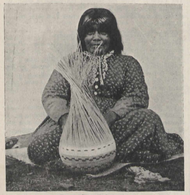
FIG. 1.-Pomo Basket-maker.

As is usual in publications coming from the United States, this work is lavishly illustrated, there being 212 figures in the text and 248 beautiful plates, several of which are coloured. The memoir deals with basket