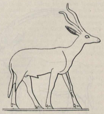
animals, FIG. 3.-Lesser kudu (?) from the Ptahhetep h belong Chapel.

east Africa generally. Antelopes of other kinds, including some of the smaller gazelles, are recognisable on various Egyptian fres-coes, but their exact specific determination is difficult or impossible. Cattle are frequently depicted, but be appear to all domesticated none of which belong to the humped breed,