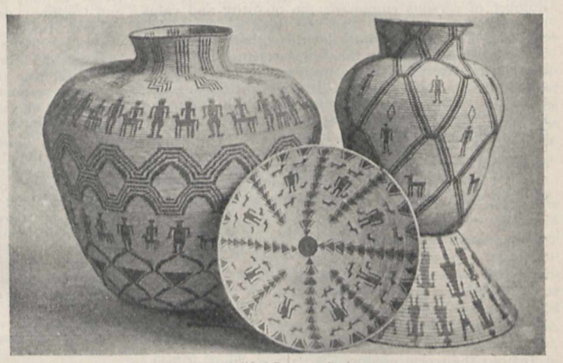
F1G. 2.-Modified Forms on Basketry.

Owing to differences of climate, rainfall, and other characteristics of environment, the materials for