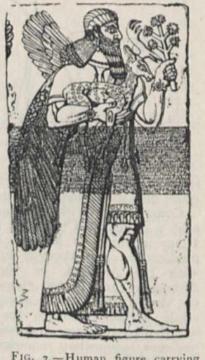
IG. 7.—Human figure carrying Mesopotamian fallow deer, from the Palace at Nimroud.

The last, but by no means the least interesting, sculpture to which I shall allude is one from Nimroud of which a woodcut appears allude is one from Nimroud of which a woodcut appears on p. 225 of the work above cited, where it is de-scribed as a "Bull-hunt." The horns of the animals depicted are, however, as shown in the accompanying re-production of the cut (Fig. 8), quite unlike those of the bulls represented in the Egyptian frescoes, and strongly recall those of the white-tailed gnu (Connochaetes gnu) of South Africa. Moreover, the tails of these animals are of the same type as those of the horses shown in this and other sculptures and are quite different from those of the other sculptures, and are quite different from those of the oxen of the sculptures and frescoes, which have a somewhat club-shaped form. It would appear, therefore, that the portrait is that of an animal with a fully haired tail