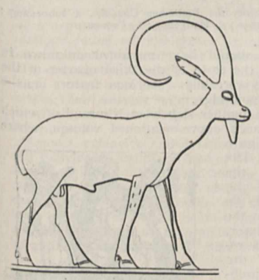
FIG. 1.—Nubian ibex, from the Ptahhetep Chapel.

ing that these for the most part represent ungulates, the portraits of Carnivora being far more difficult to assign to their respective species.