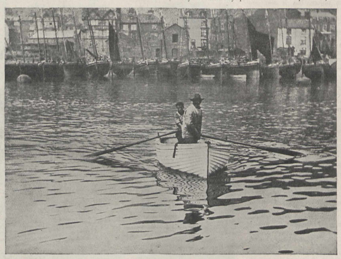
Fig. 1 .- Old Harbour Side, Scarborough. From "Light and Water."

THERE are few studies more fascinating than that of the reflexions formed naturally in the sea, and in rivers and lakes. In the first place, this study is naturally pursued in the open air; further,