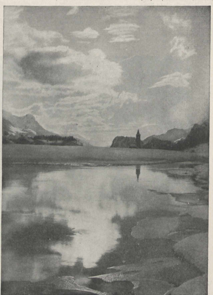
Fig. 2.-Sils Baseglia, Upper Engadine. From "L'ght and Water."

inherent colour of the water, modified, maybe, by the presence of fine suspended particles; partly to the colour of the stones, sand, or mud at the bottom of the water; and, lastly, the whole effect is complicated by "contrast," which may modify greatly the various colours observed. For instance, standing on one of the cliffs of Sark, and looking out over the sea, the latter often appears of a vivid green, dappled here and there with patches of intense purple. Careful observation shows that the purple patches mark the