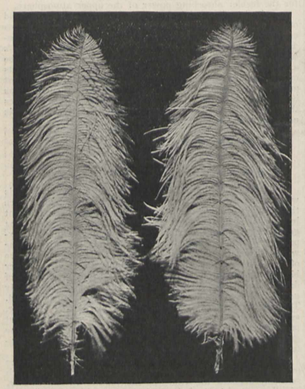
FIG. 1.-Ostrich feathers showing barring.

The development of the ostrich feather has not yet been