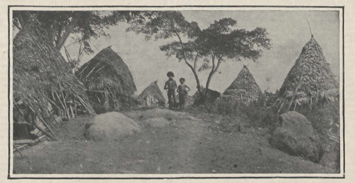
FIG. 1.- The native village of Dinawa. From "Two Years among New Guinea Cannibals."

Mr. T. E. Heath: Stereoscopic star charts and spectroscopic key maps.—Rev. A. L. Cortie: Photographs of the solar corona, 1905, August 30, taken at Vinaroz, Spain, with a 4-inch lens and 20-feet coronagraph.—The Solar Physics Observatory, South Kensington: (1) Photographs illustrating the eclipse camp at Palma, Majorca (August 30, 1905), and some of the results obtained. (2) Examples of stellar spectra taken with the 6-inch two-prism prismatic camera. (3) Some photographs taken with the spectro-