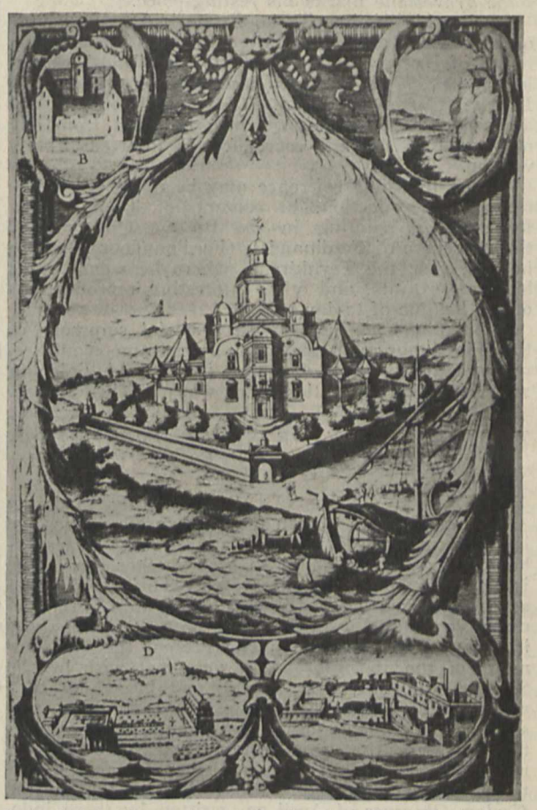
Tycho Brahe's Observatories. A, On the island Hveen (Uranienberg); B, in Wandsbeck; C, in Benatek; D, in Prague (Ferdinandeum); E, in Prague (Curtius's House).

THE Astronomical Observatory of Prague, like many other similar institutions which might be mentioned, has its work considerably restricted by the fact that the city in which it is situated has