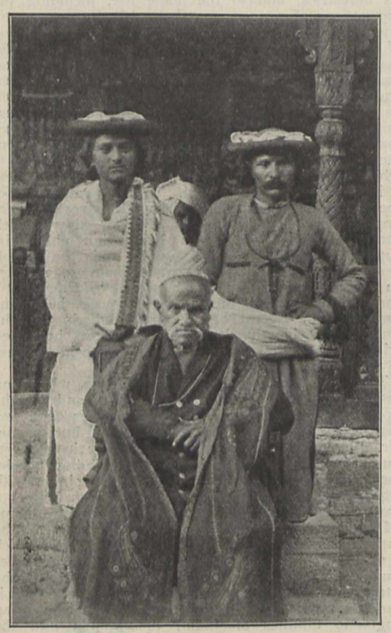
Fig. 1.—Raja of Rampur, with attendants, Punjab Hills. From "Natives of Northern India."