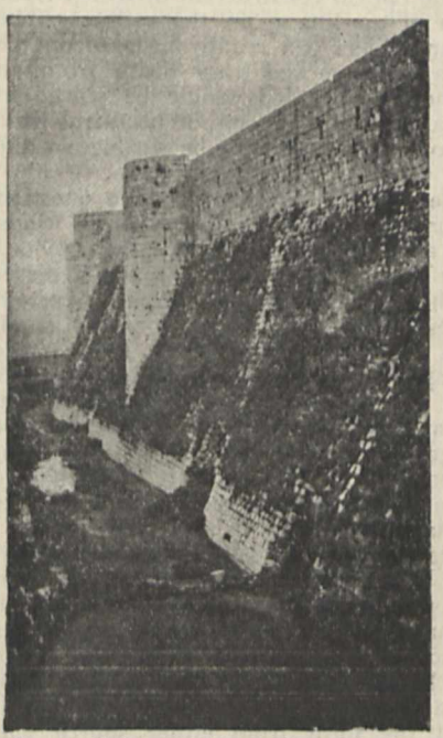
Fig. 1.—Kala'at el-Ḥusn, walls of the inner lenceinte. From "The Desert and the Sown."

his "mountain" and lords it over Moslem and Christian alike, despite the suzerainty of the Turk. Here the wild Arabs, 'Anêzeh, Ghiath, and Shammar, still live as they did in the days of old, rearing