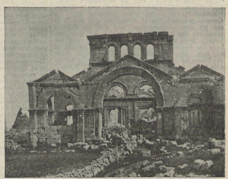
Fig. 2.-Kala'at Sim'an, the west door. From "The Desert and the Sown."

North of Damascus Miss Bell again met with the Drûz, the members of that faith who live in the