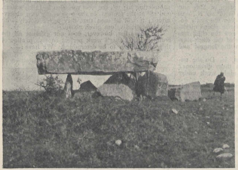
FIG. 8 .- Druid's Altar at Pawton, near Eodmin, looking to May sunrise.

One of the first things that they wanted to be pro-