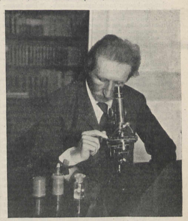
Prof. E. Strasburger.

The principal windows of the laboratories and of the residence overlook the palace garden, which has been the botanic garden since the founding of the university. The garden, though small in area, is well stocked and rich in flowering plants. The latter occupy the central part of the grounds, which are carefully laid out and arranged according to the system of Eichler. On either side of the central part is the arboretum, containing many fine specimens of European and some American trees. The arboretum is rich in conifers, one, a cedar of Lebanon, being unusually large and beautiful. A portion of the old palace moat is maintained as a pond for aquatics. The large palm house, the Victoria house, and other greenhouses contain many interesting exotics. The garden has also its special beds of poisonous, economic and medicinal plants, as well as one con-