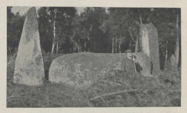
FIG. 20.-The recumbent or directing stone and supporters of the Cothie Muir Circle, a normal example,

I append a diagram which shows the connections